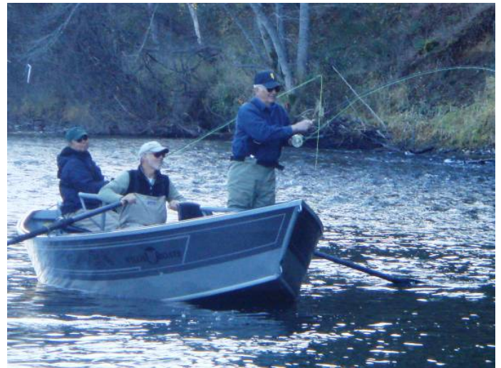
Just look at those fish!