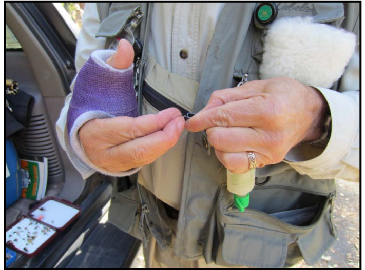
Lowell ties on a fly without an opposable thumb