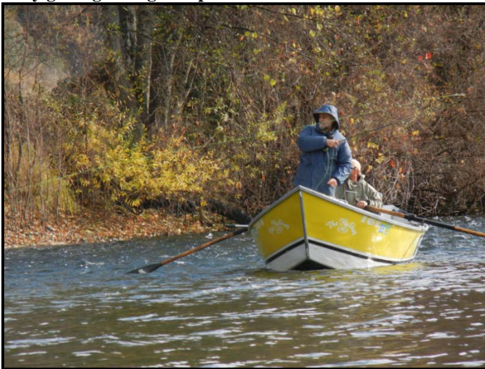
Cary sets the hook