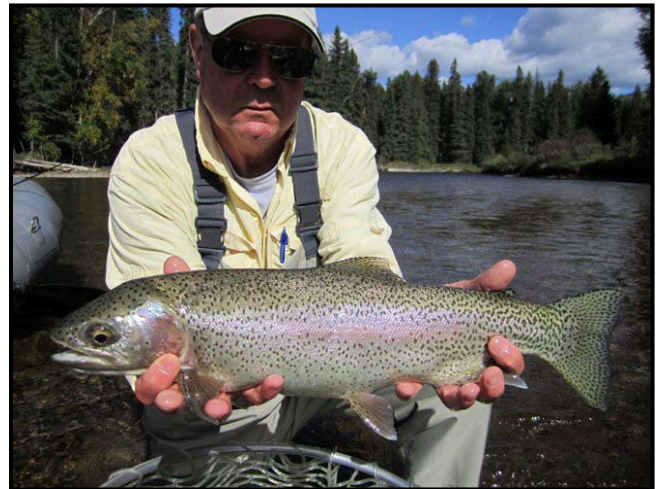
...and another, bigger one!