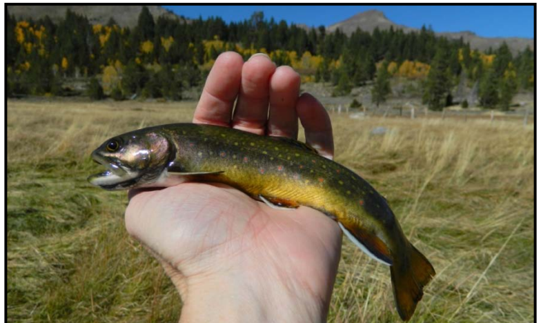
Fine Eastern Sierra Brookie