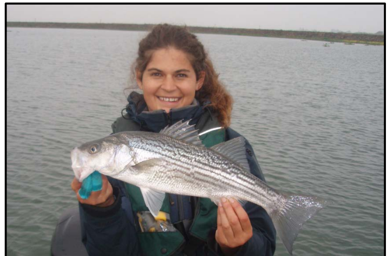
...and a striped bass!