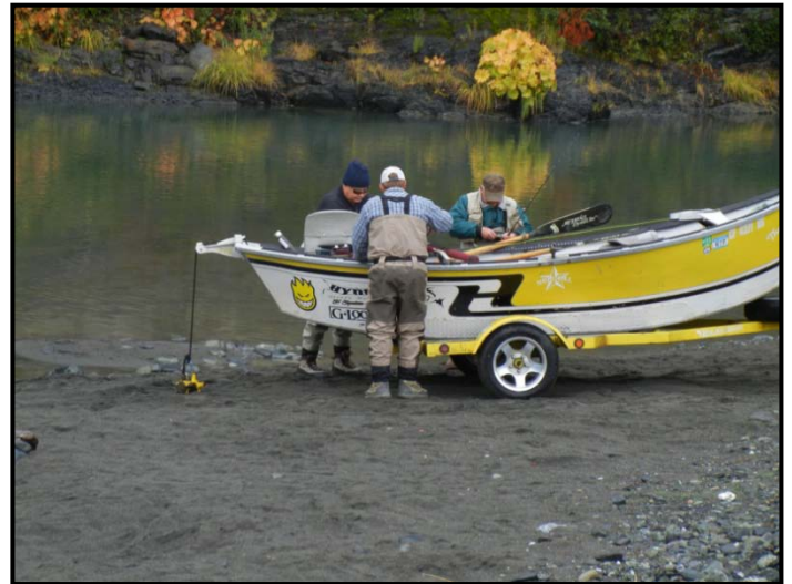
Ready to get on the water...