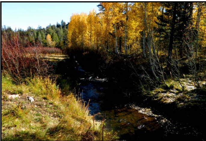
Red Lake Creek