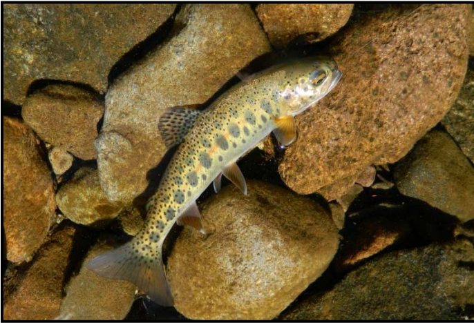
Wood's Creek Rainbow