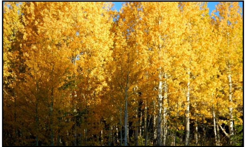
Aspens along Highway 88