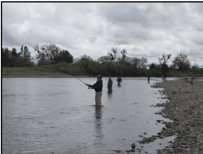
The group spreads out to practice...