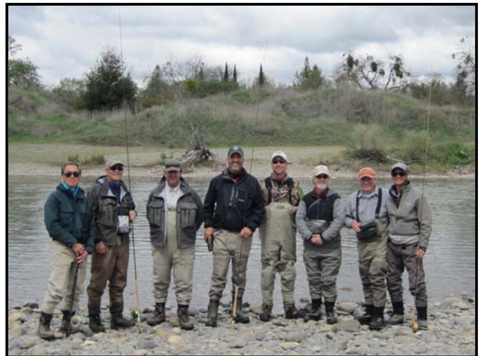
...and pose for photos.