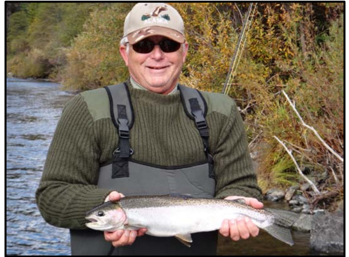
And it's a nice steelie