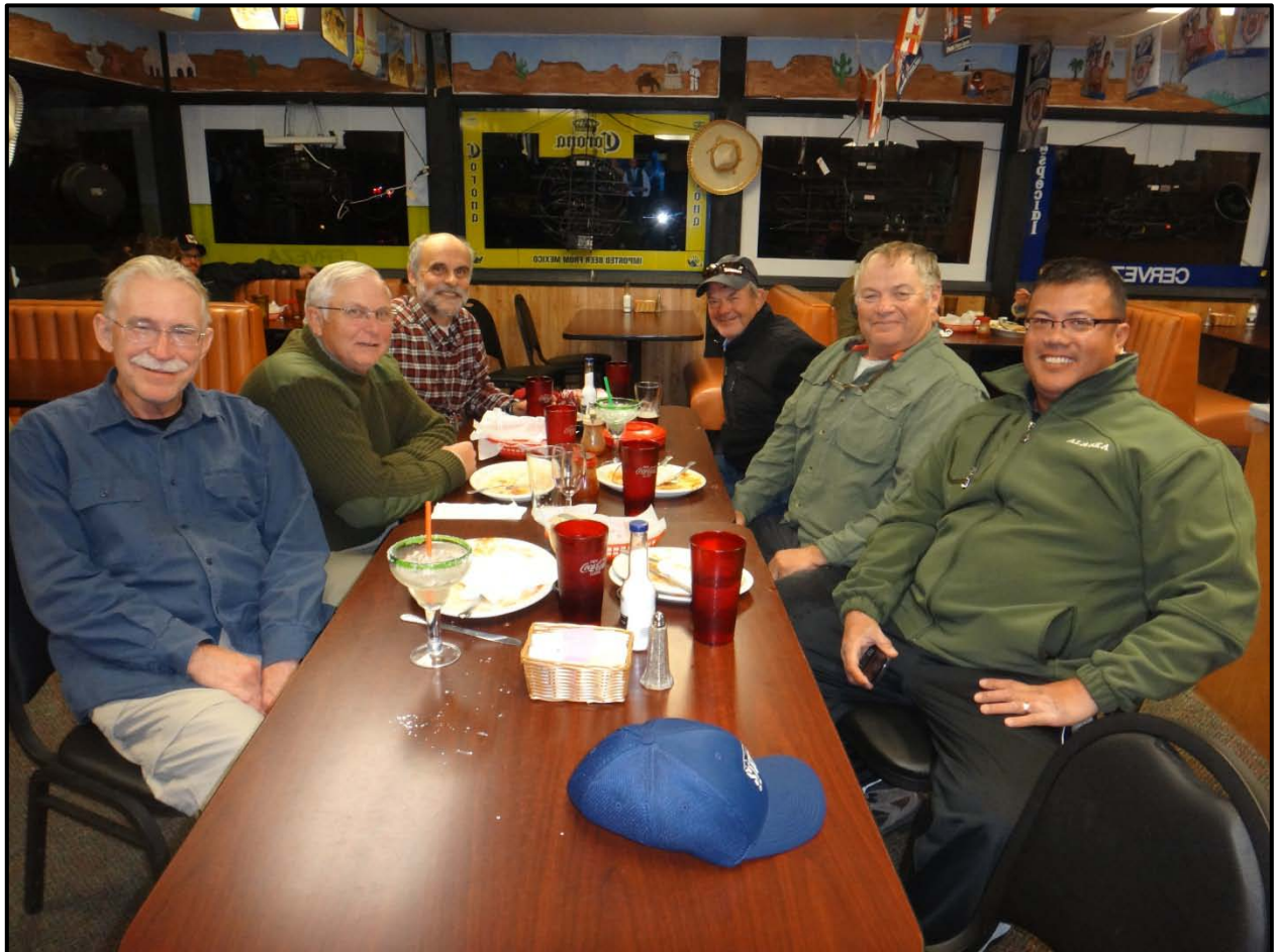
That's a hungry group of fly fishers!