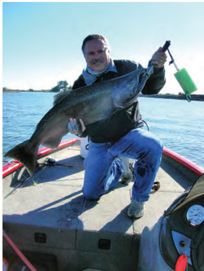
Wait.... That's not a striper!