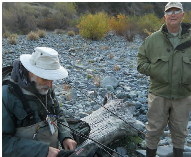
Waiting for the guides to drift some water to the South Fork.