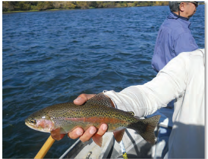
Imsdahl Sac Fish with Guide Matt Dover