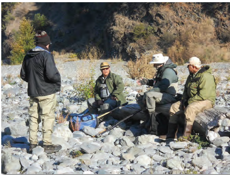
When are we going to leave?... the fish are waiting.