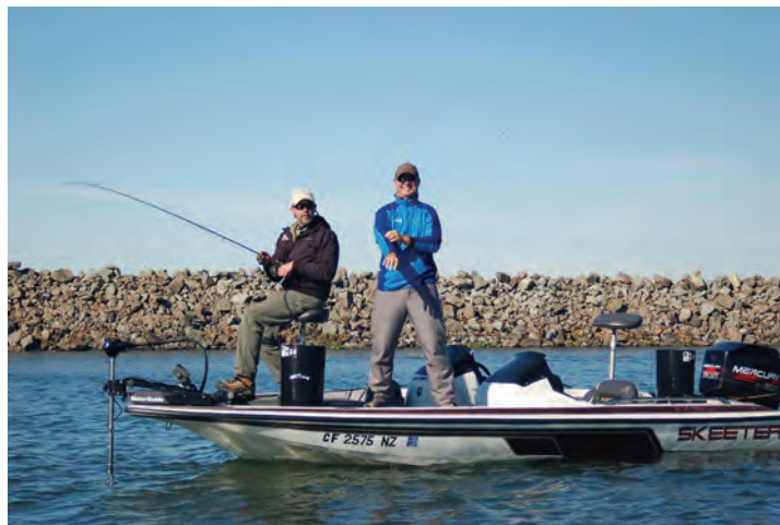
Someone owes this Team dinner!