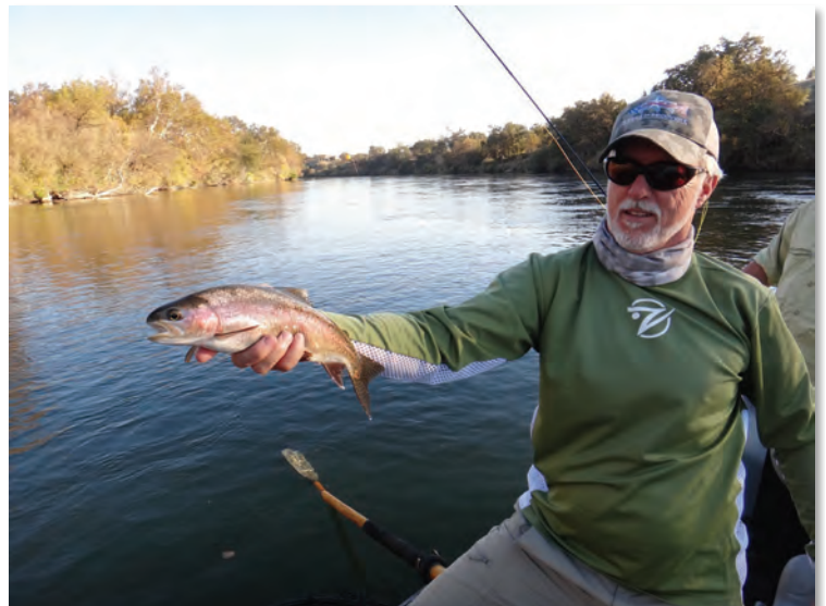
Fly Shop Parker showing off a Doc Joe fish