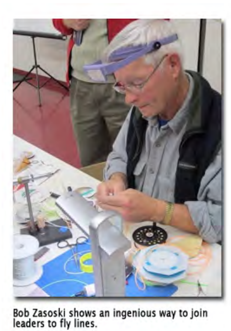
The following members are up for election:

The December meeting is also our annual business meeting. The only matters on the agenda are the election of officers for 2014 and two new Board members to serve three year terms beginning in January.