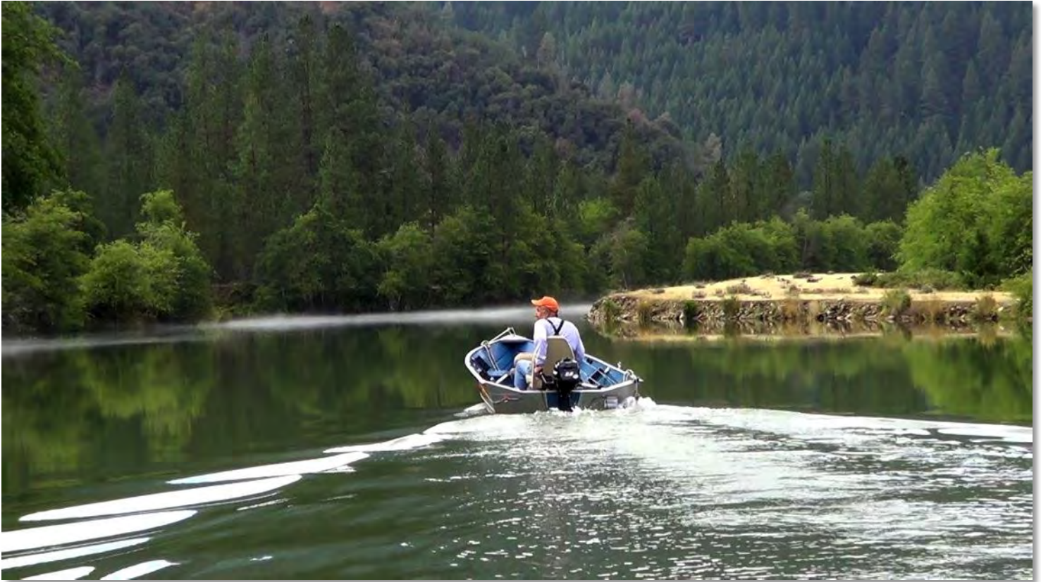
Early Morning mist on Lewiston Lake