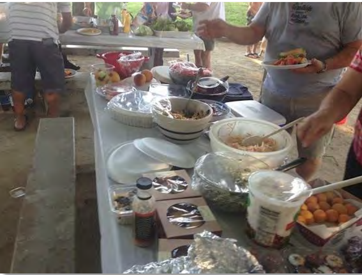
Plenty of tasty sides and desserts for everyone to enjoy