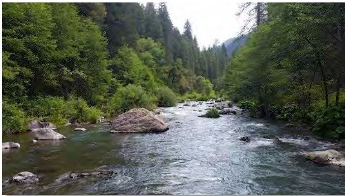
The McCloud slightly milky with a green tint

Sunday was a morning of relaxing and great conversation with all the attendees. Some went to try some of the upper McCloud while the rest of us prepared to head down the hill into the dead heat of Summer.