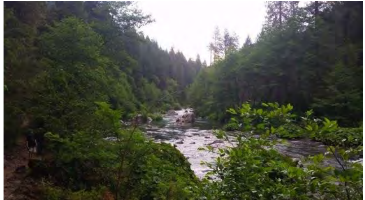
It will not be fishable in the upcoming weeks due to glacier melt