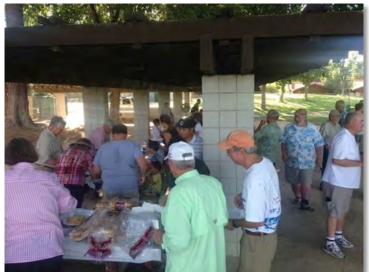
Nice turn out this year