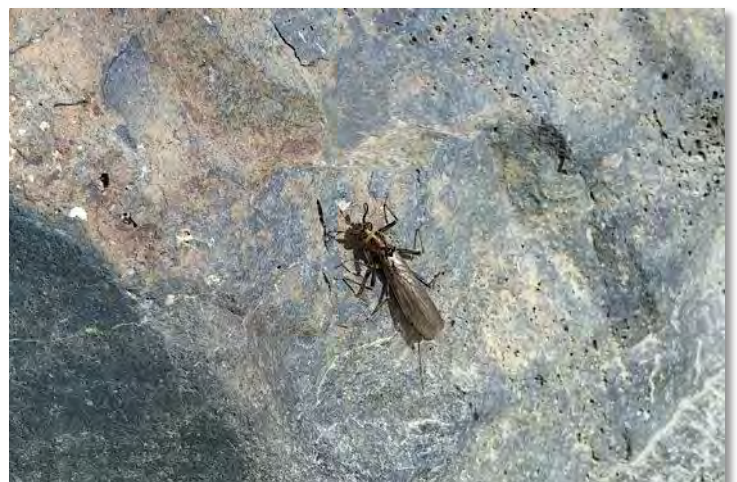
Despite the Skwala Stonefly hatch the fish weren't aggressive