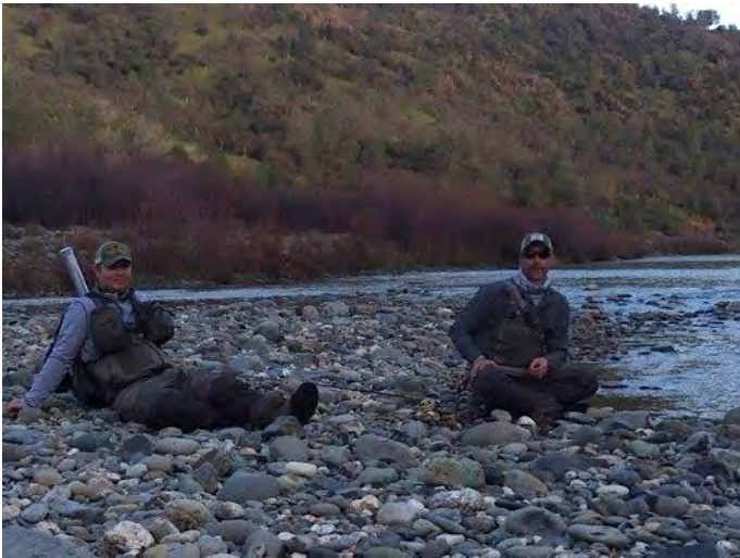
These two have called it a day!