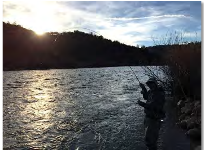
Son Chong is still going at it!