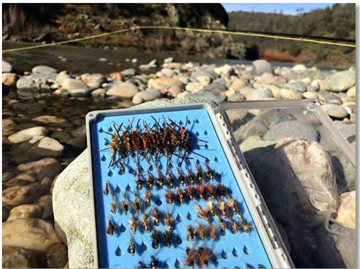
Hmmmm.... What should I tie on?