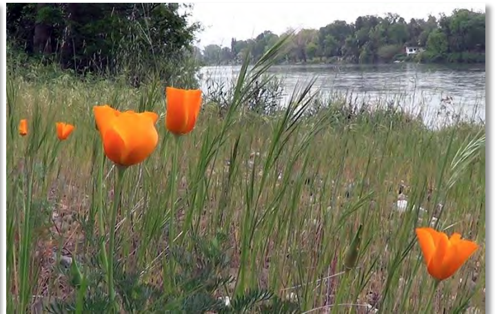
Springtime on the River