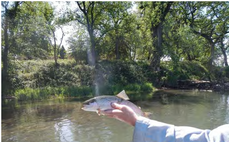
This trout was divine