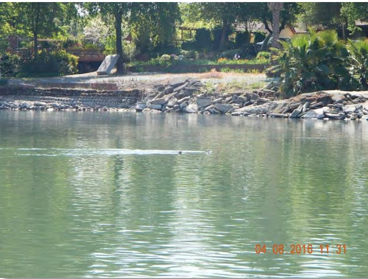
Family of River Otters at Play