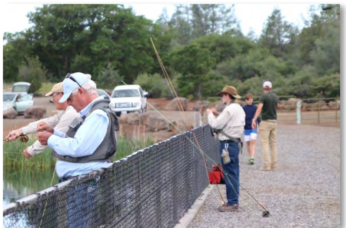
The line up... The fish don't have a chance