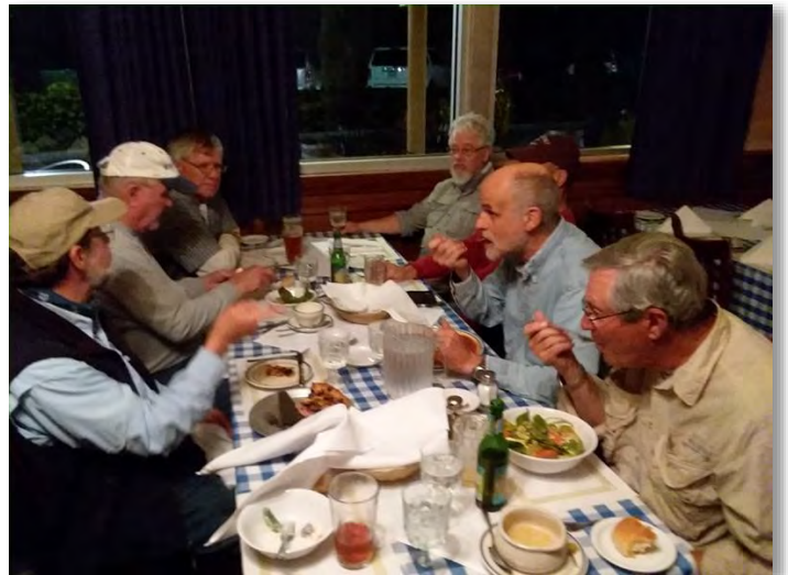
The crew enjoying a meal at Symposium in Davis