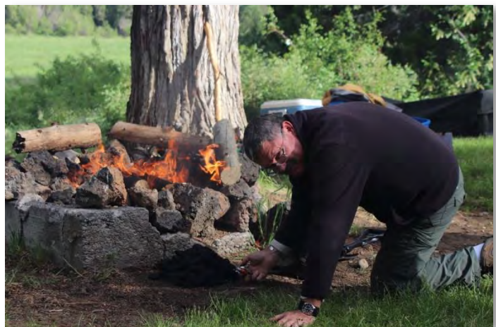
Don't try this at home!