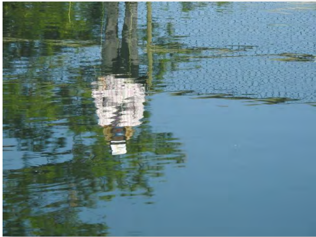
In moments of reflection