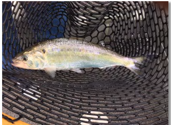
Beautiful fish, but I keep hearing they smell