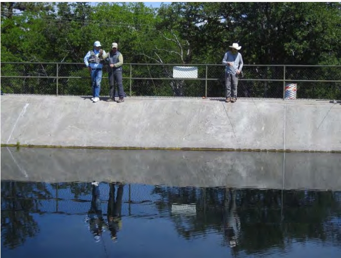
They are in there somewhere