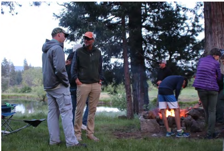
Time to gather around the fire pit