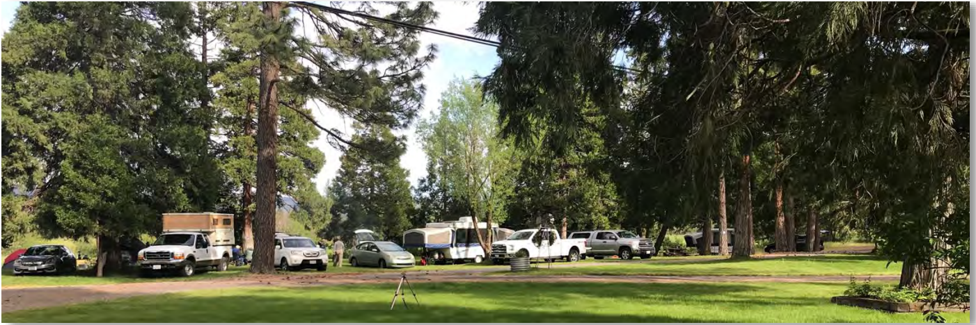
The group campout at Hereford Ranch RV Park

Thanks for making it a great outing everyone.