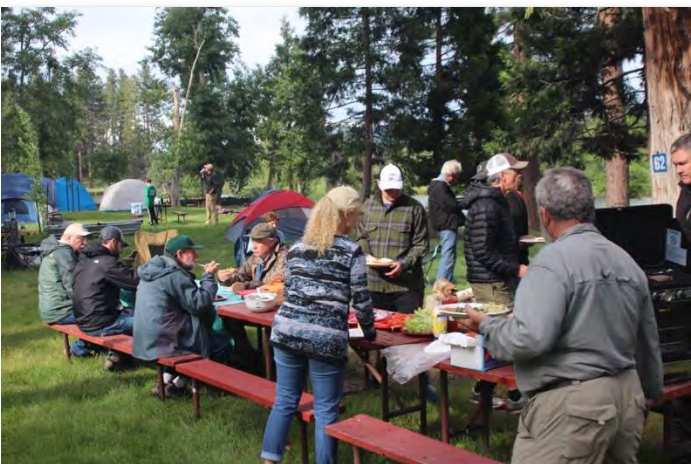
Great group of FFD Members