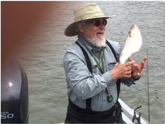
and are slippery suckers