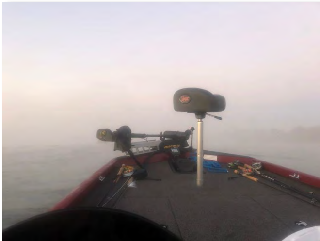
Foggy morning! Where are we?

The weather cooperated at this year's striperfest, but the big fish did not. 6-7 boats launched at various locations on the delta in search of that elusive large striper on a foggy Saturday morning. Everyone caught fish, including Ryan and Kevin enjoyed their first experience on the California Delta, but the big fish remained tight lipped and clandestine. With the warmer water this in the system, it seemed like it was 50/50 Stripers & Large Mouth Bass.