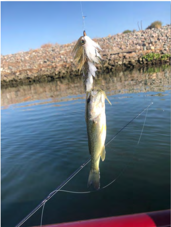
What is bigger the fish or the fly?