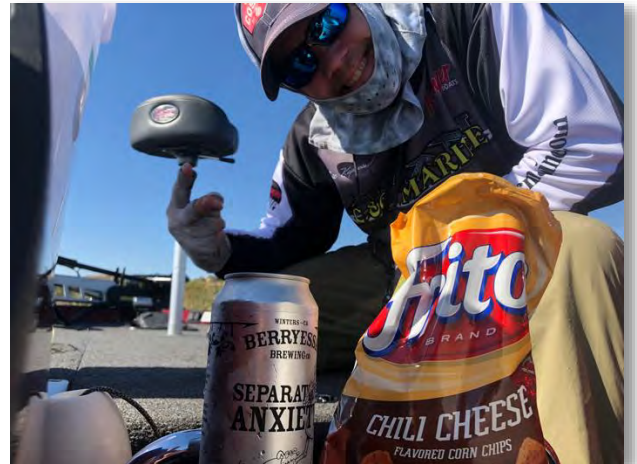
Time for lunch!