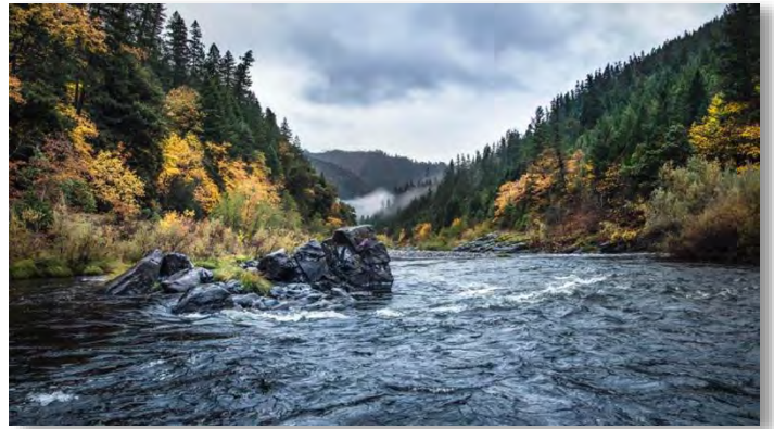
Plenty of fast water and rocks to dodge