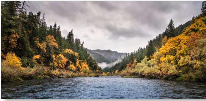
Ominous skies greeted us a launch Sunday morning