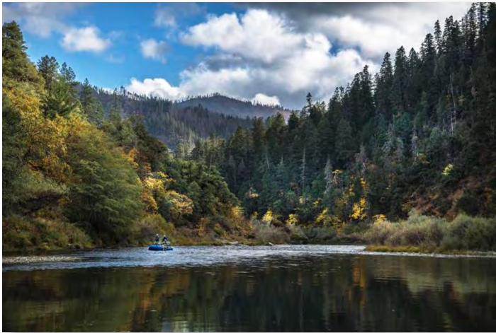
And they did...