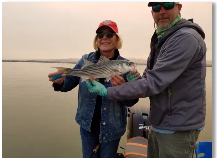
Her biggest of thte day