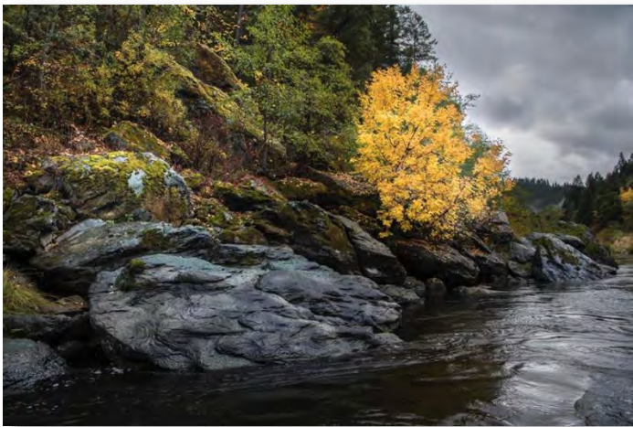
And amazing colors