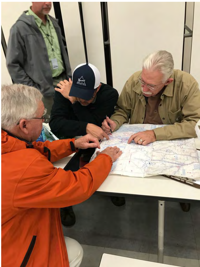
Members sharing their delta hot spots