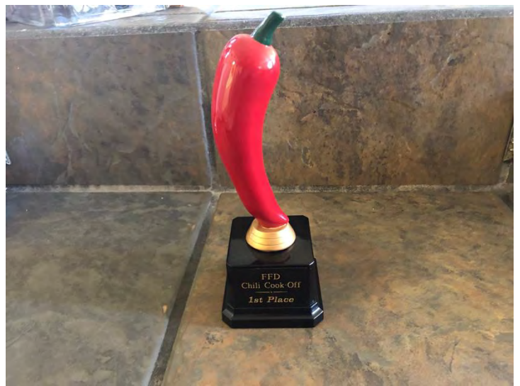
The coveted chili pepper trophy