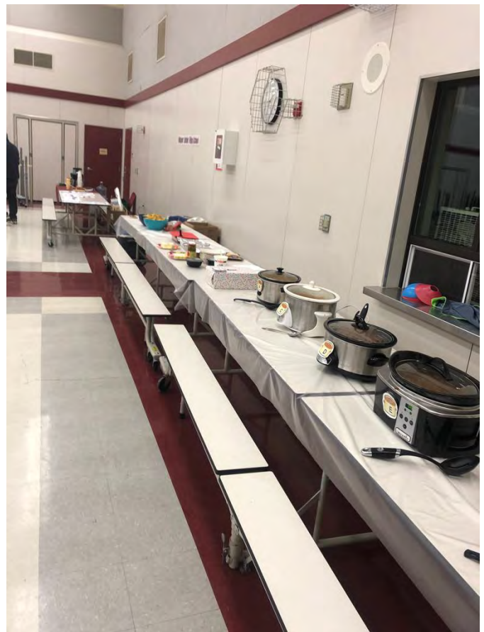
A fantastic lineup of chilis to taste