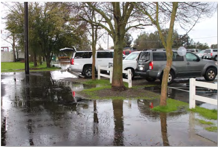
We may have a lake to fish if this rain continues!