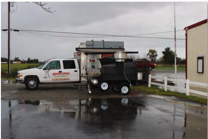
Hickory Hank continues to prep during the storm.. Thanks Hank!