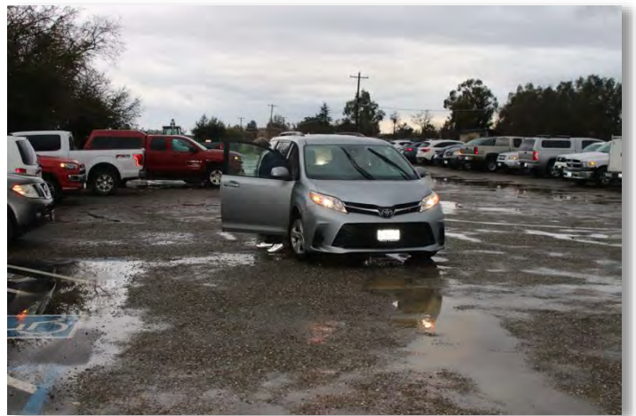
The guests are arriving...