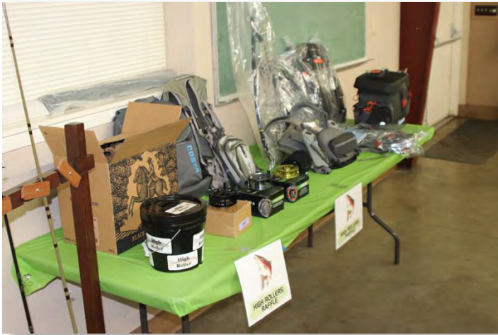
Look at those High Roller items