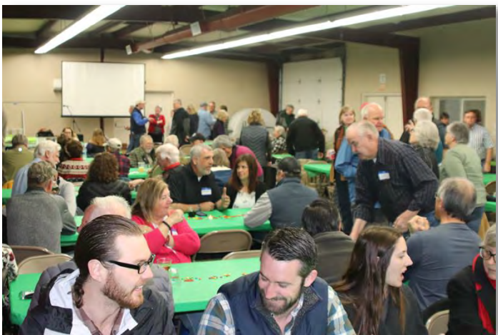
Great turnout. Everyone is enjoying themselves