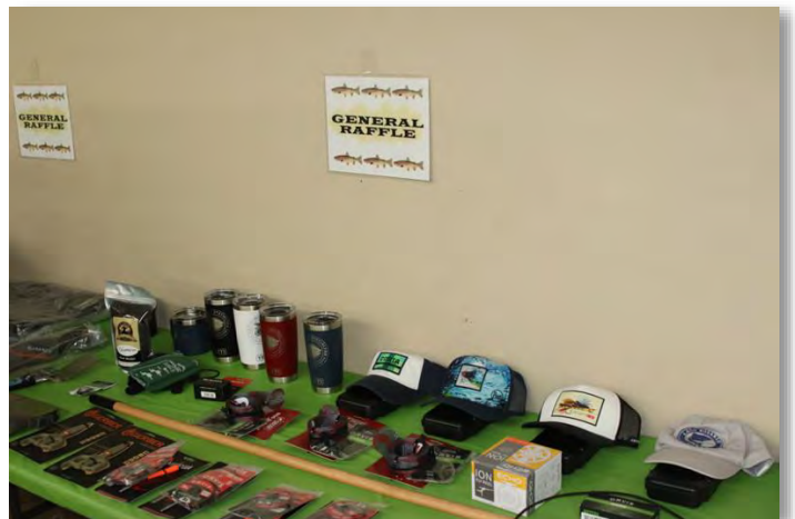
Awesome setup of raffle items