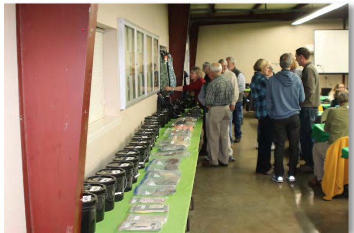
Look at that line of bucket items.