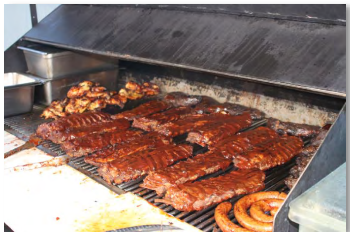
Yum! The money shot