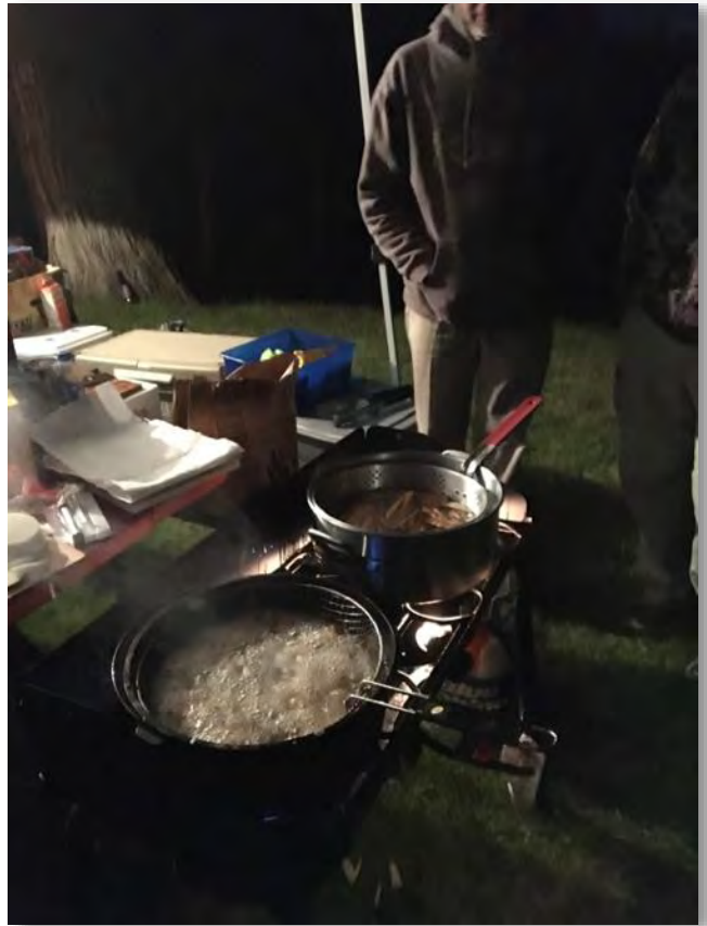
Fries, onion rings, hush puppies