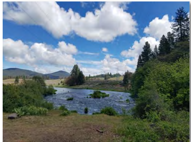
Beyond the canal... Sunday fun on Hat Creek