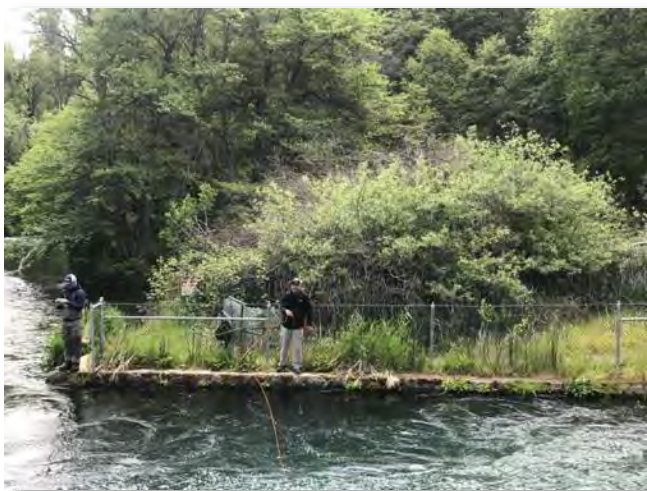
One group hit Power House on Hat Creek