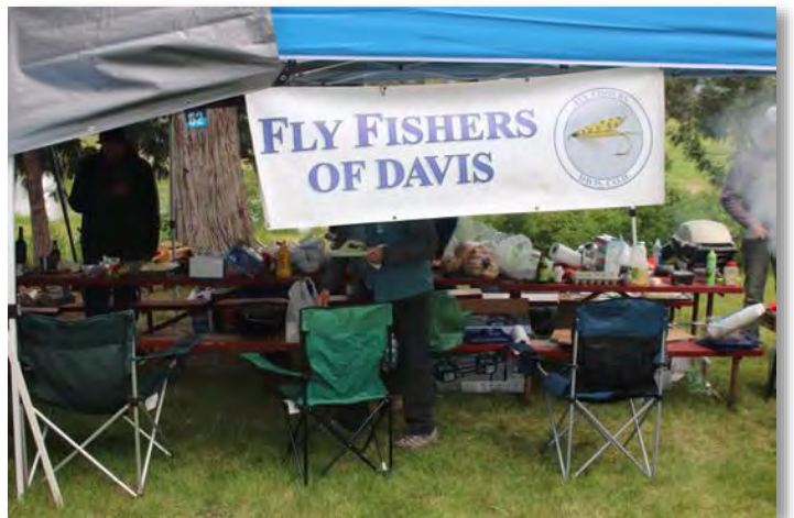
Forecasted rain will not spoil this evening