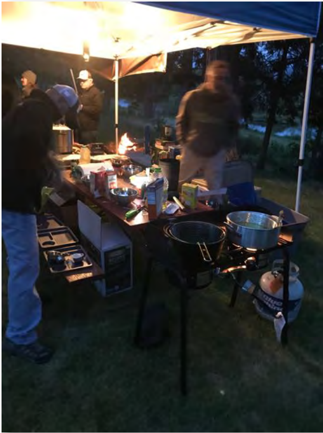
Lots going on Friday night