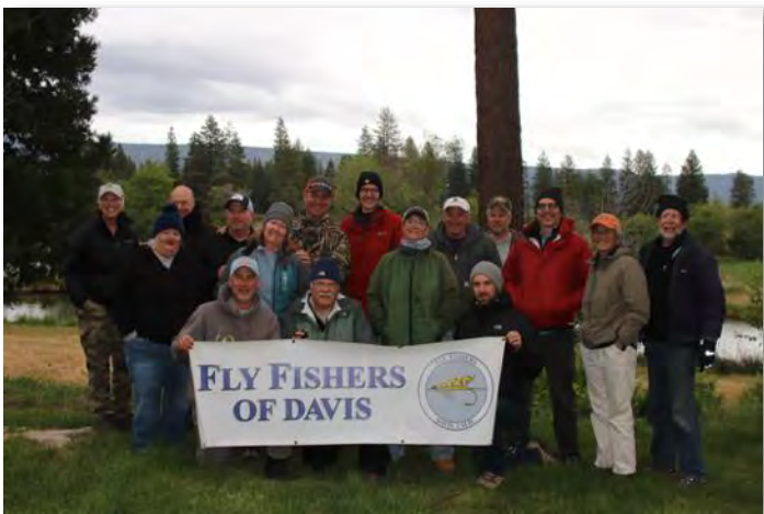
The FFD 101 Hat Creek Weekend group