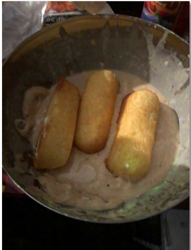
Fried Twinkies for dessert... WOW!