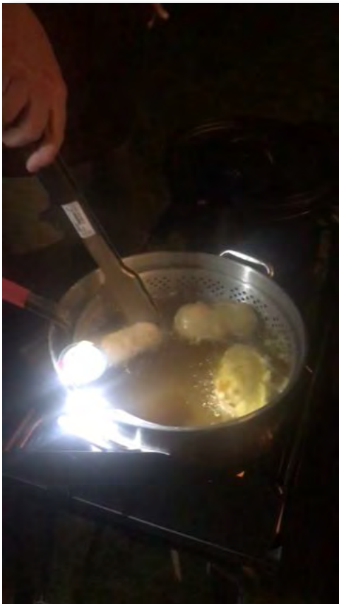
Not keepers: Catfish and Rock Fish