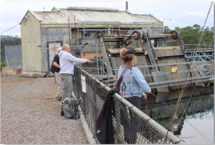
The group hits the Hat Creek canal Saturday morning