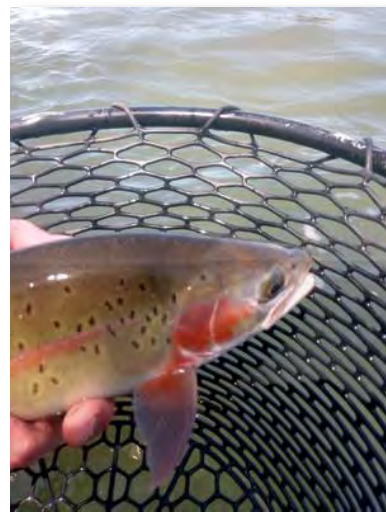
Say Cheese... Another fish in the net