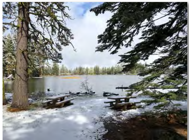
Sunday on Manzanita Lake... Looks like winter wonderland