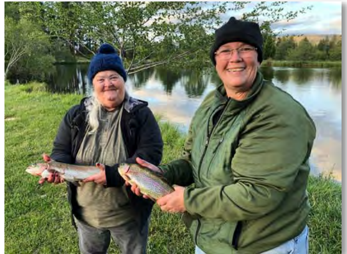
And come up with some nice fish