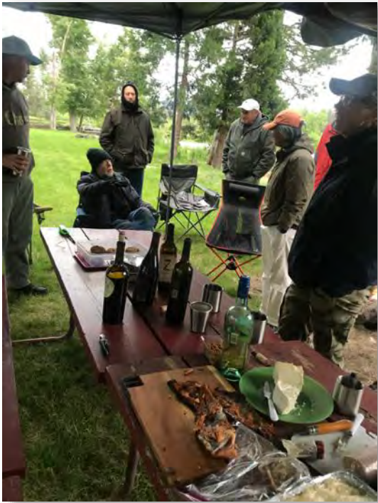
More fish stories!