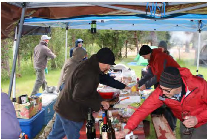
Time to get ready for Saturday night's feast