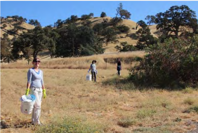
It was great to see volunteers young and old at the cleanup day