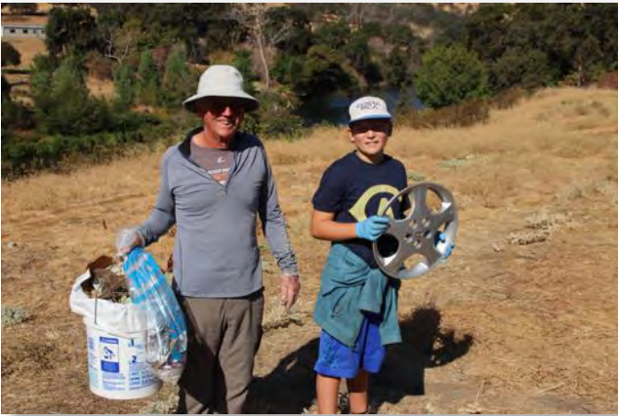
The group found 4 hubcaps among the 600 lb + trash