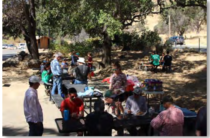
The group enjoys their lunch after working hard