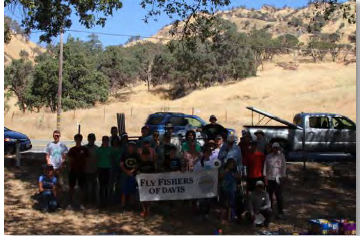
Thanks to everyone for making a difference on our local waterway!