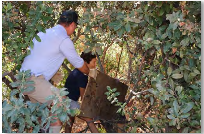
Someone dumped their old hunting blind on the side of the road