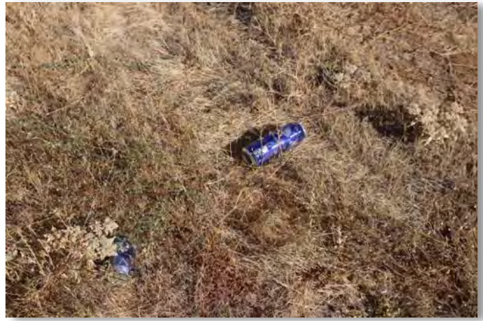
You would not believe the number of beer cans along the road