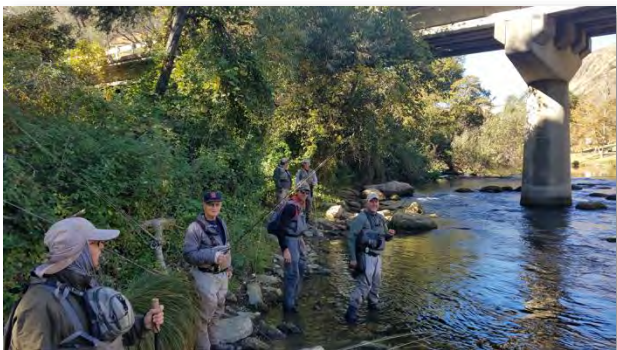
The Streamer Techniques Class on Putah Creek