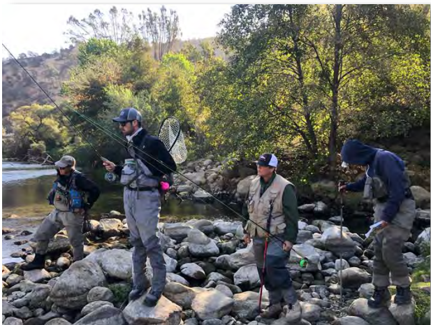
The participants are eager to use what they have learned