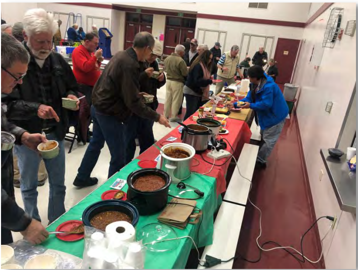
The lineup for the 2020 FFD Chili Cook Off