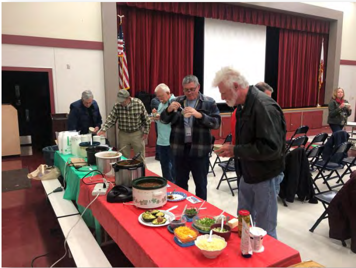
One more taste before casting their votes