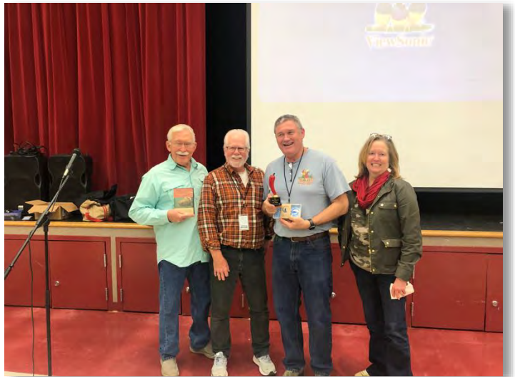
Congratulations to our Chili Cook Off winners!