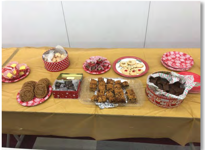
FFD Members cookie exchange to celebrate the holiday