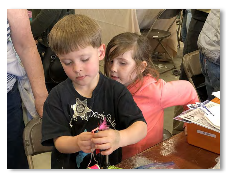
The students become the masters