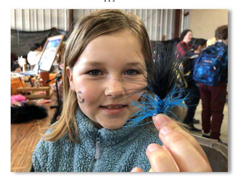
Great looking fly!