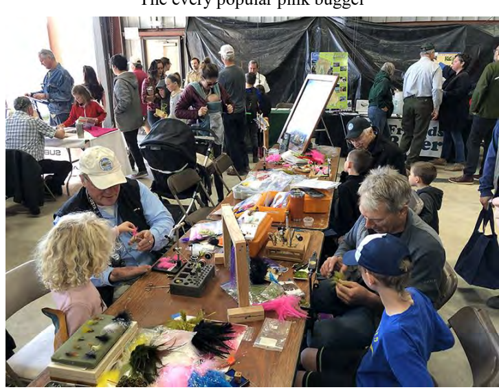
Great turnout THANK YOU to all of the FFD volunteer tyers