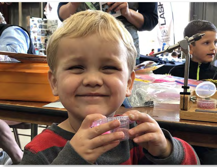
Somebody is going home a happy camper