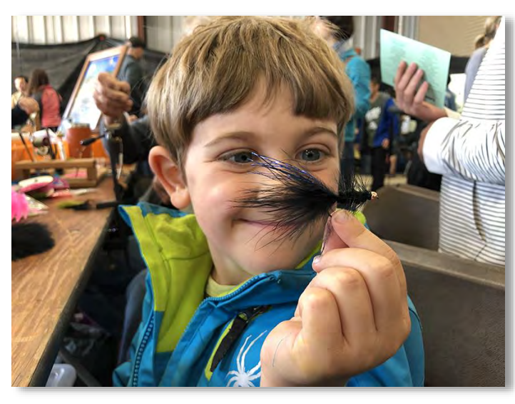
That will fish!