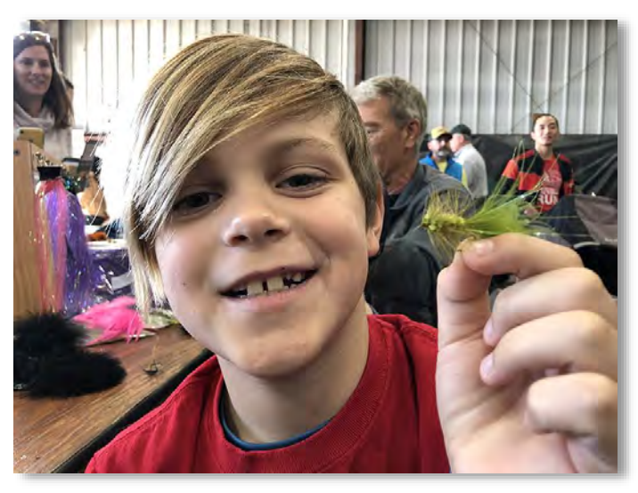
Awesome looking whooly Bugger