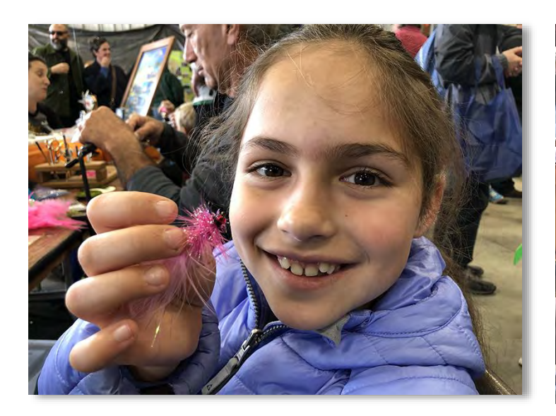
The every popular pink bugger