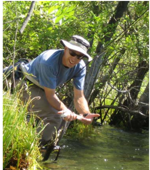
Nice Trinity Picture