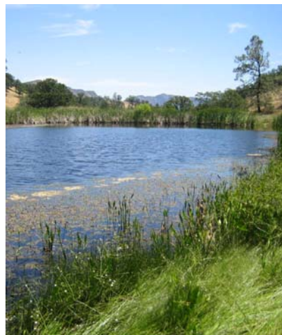
First pond at Payne Ranch