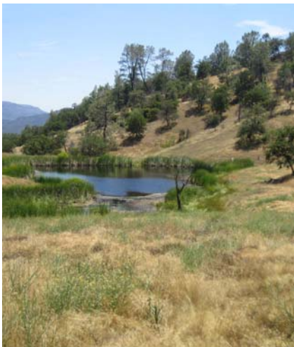
First pond at Payne Ranch