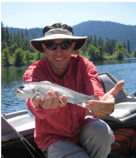
Lonely Lake Trout