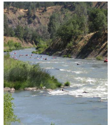
Rafters on Cache Creek