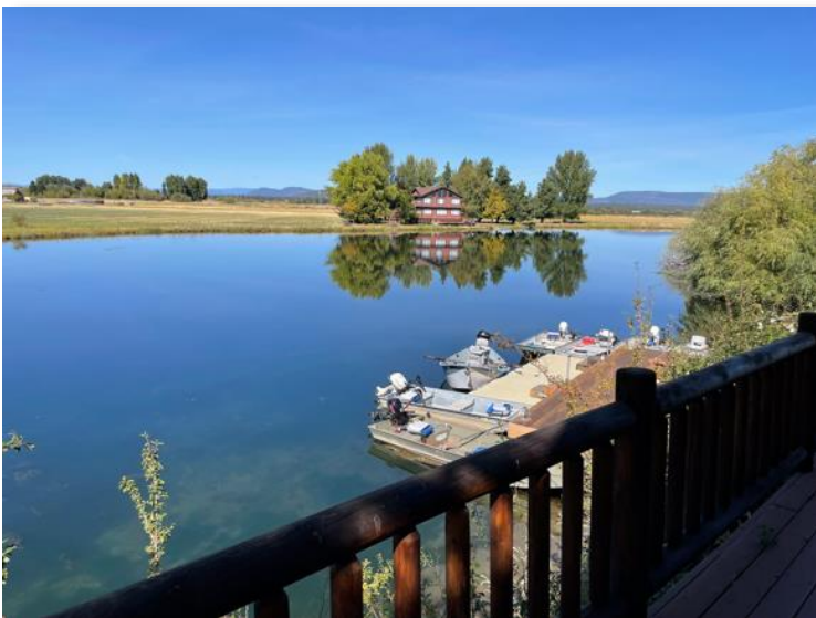
View from the paio