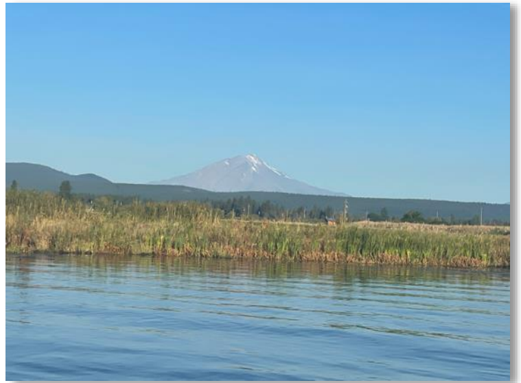
Mount Shasta still has a little snow