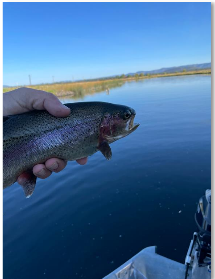
These fish are HOT