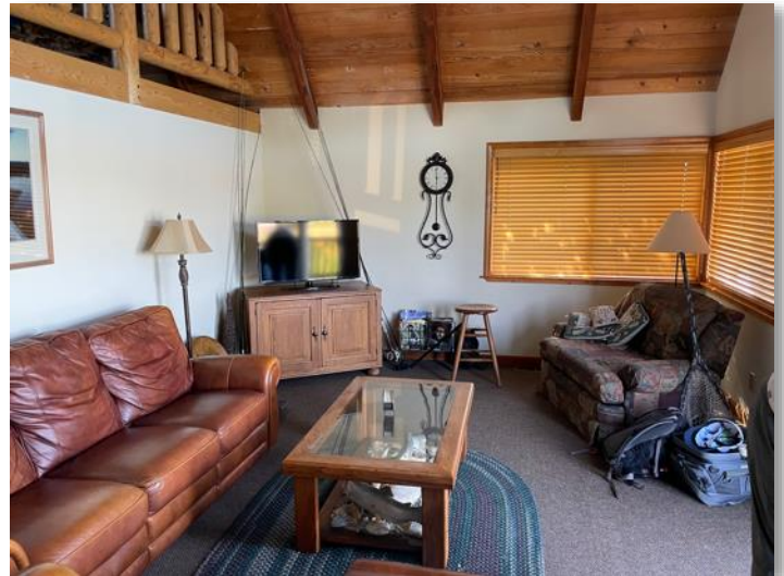
Very nice place. Sleeps 6 comfortably