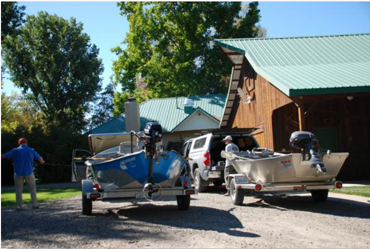
Checking into to Cabin House at Circle 7 Ranch

A few members headed out to the Fall River in October. We stayed at the Cabin House at the Circle 7 Ranch. It was a beautiful setting. Fishing was a bit sporadic as the water was crystal clear and the fish were skittish and there was a lot of vegetation floating down the river with the current, but we all caught fish and they were HOT. Looking forward to trying Fall River in the Spring.