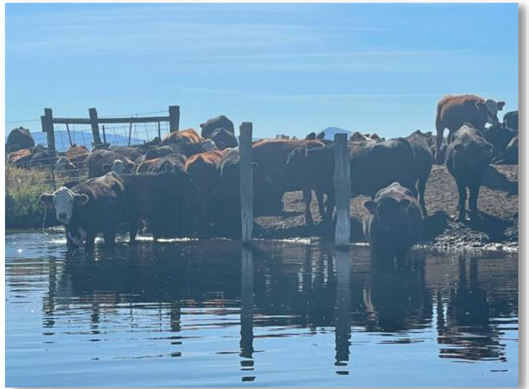
We have an audience!