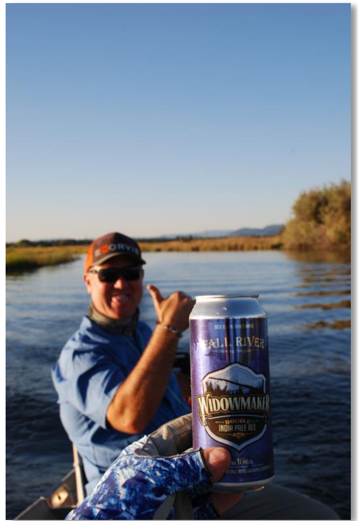
Time for a Fall River brew!