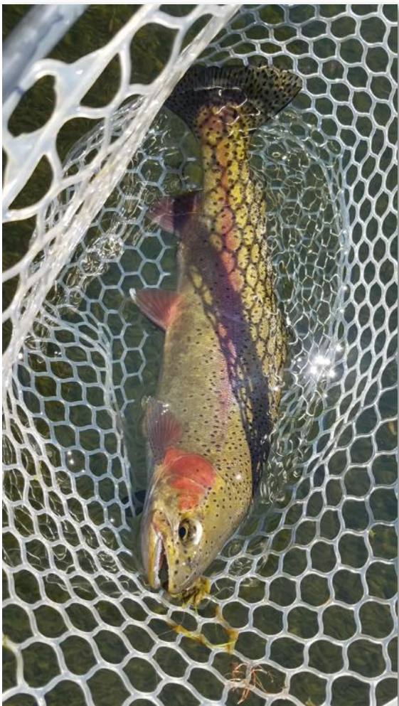
Chris lands this beast