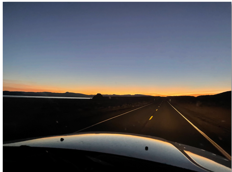
Early morning start. Let's find the fish