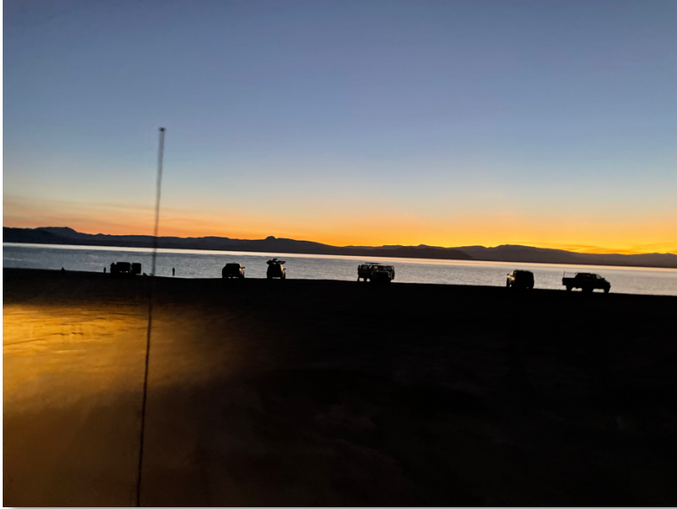
Beautiful Sunrise at Sandhole Beach. Everybody here!