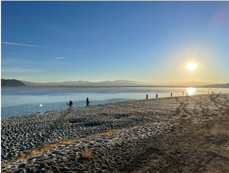
Beautiful sunrise at Blockhouse Beach

It has been over a year since this group of five FFD Members a.k.a The Wolf Pack descended on Pyramid Lake. The group was very excited to check into Trailer 8 and get to fishing. The weather was absolutely perfect, which made for slow fishing, but the fish that were caught were large and the time with friends was priceless!