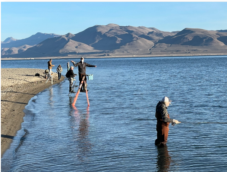
Nice crowd at Sandhole Beach