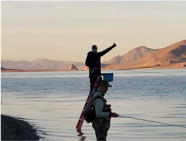
Fishing might be slow, but your with good friends