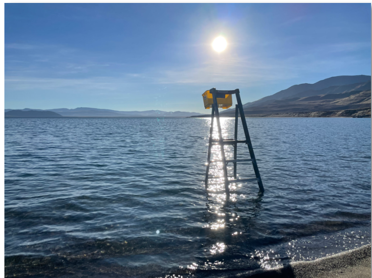
Make sure your ladder is level otherwise TIMBER!