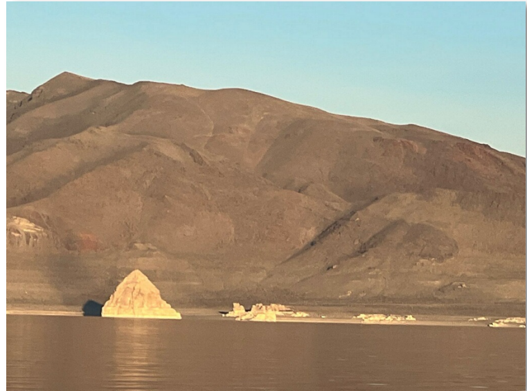
The Pyramid at Pyramid Lake