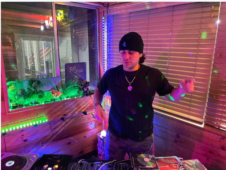
The DJ at Pyramid Lodge is playing all of our songs