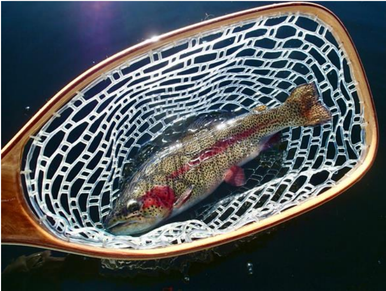
Shawn DeArmond with this beautiful rainbow trout