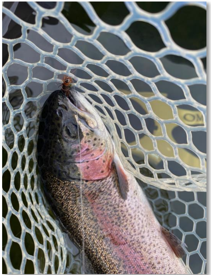
Dan Brugger nets this nice rainbow trout