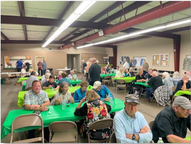
Great turnout to the FFD 2022 Annual Dinner