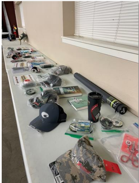
Great selection of General Raffle items