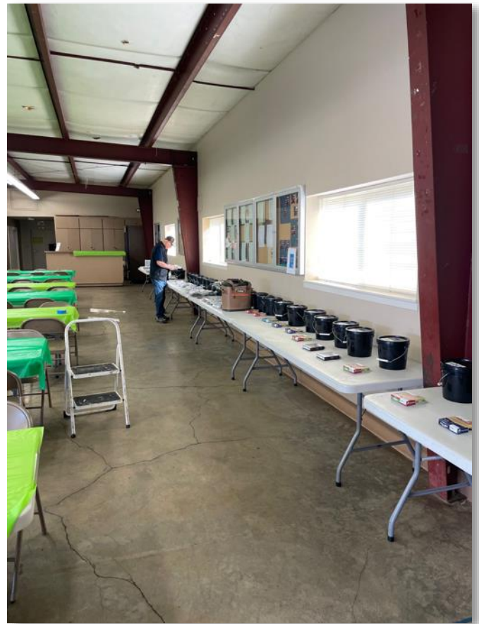
Look at that row of bucket items!