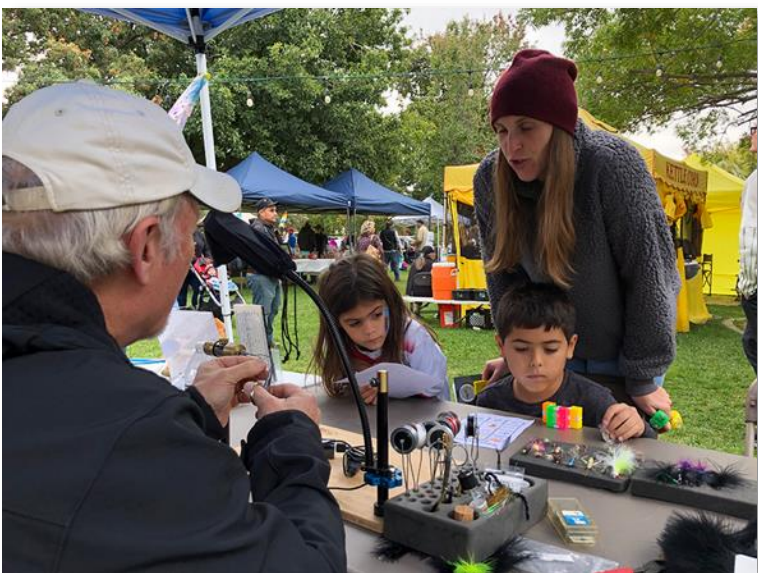
What fly would you like me to make?