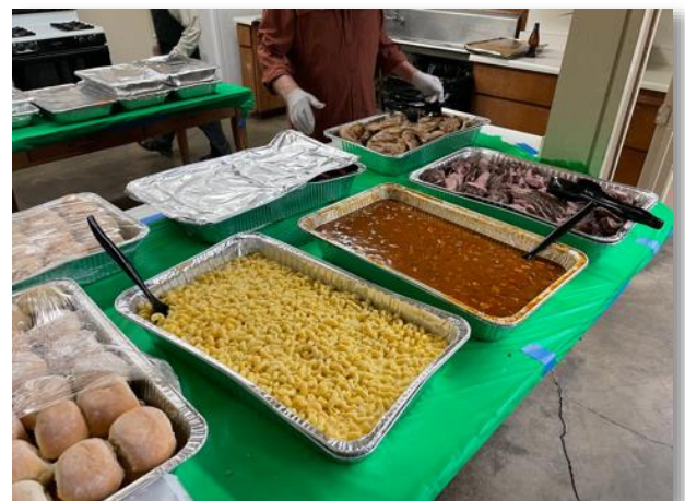
New caterer this year. Food was well received