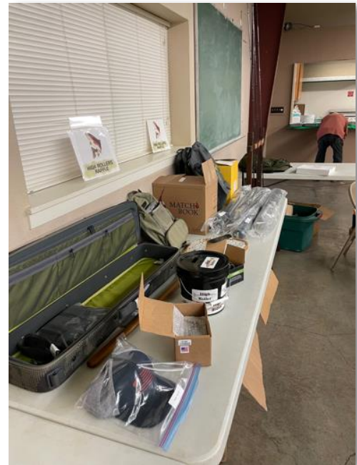
Fantastic selection of High Roller items