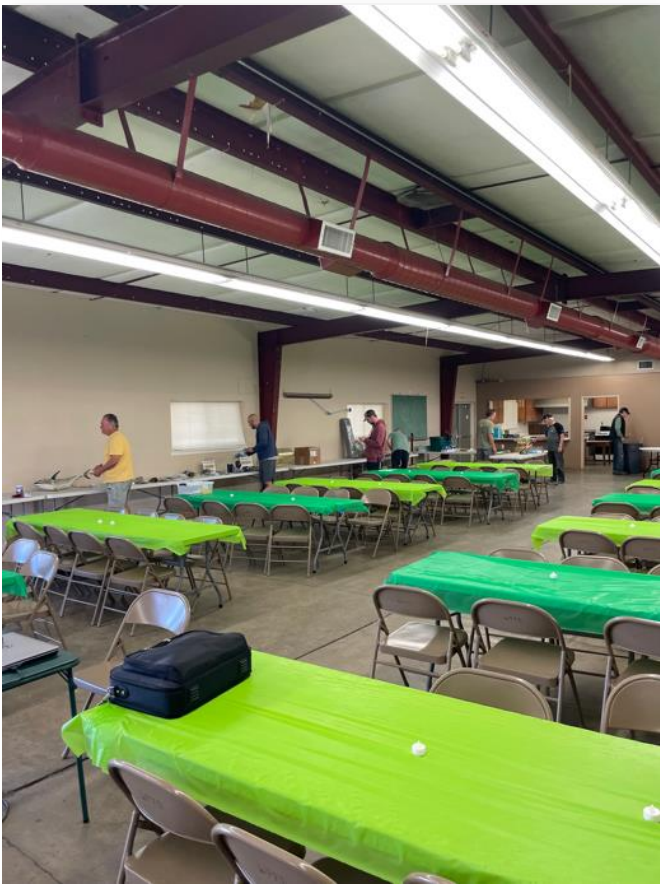
It's time to setup for the event