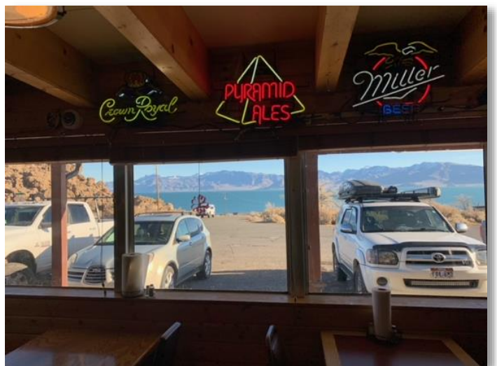
View from the infamous Crosby Lodge