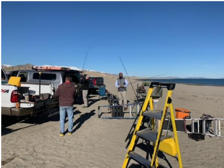
It's time to get rigged up!

In February 2023, 17 Fly Fishers of Davis Members descended on Pyramid Lake, NV which is 37 miles north of Reno, NV. Many FFD Members had never been to Pyramid Lake, so they were in for an exciting fishing outing. Pyramid Lake is where you fish off a ladder, which is setup on the drop off where the fish collect. Many Lahontan Cutthroat Trout were caught over 3-4 days of fishing. Members enjoyed fishing, dinners, and more. Everyone had a great time.