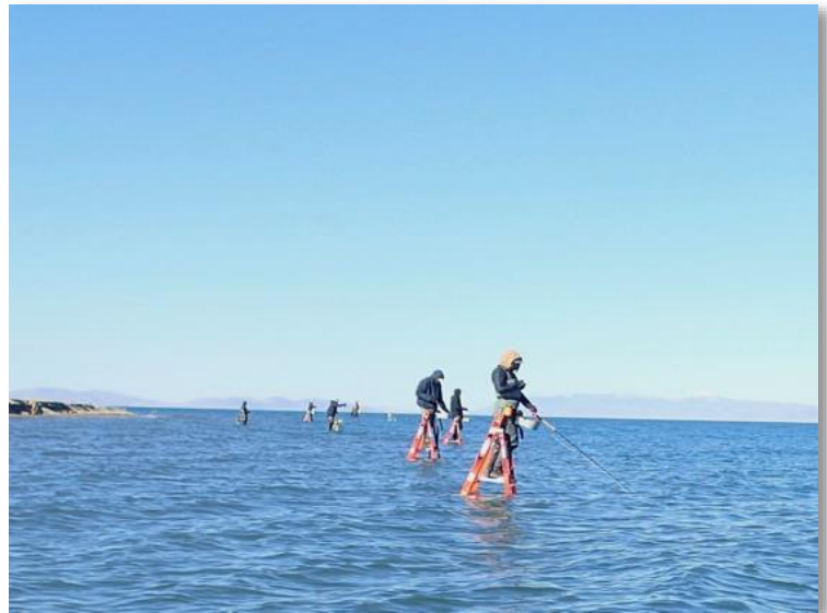
Ladders are out! Time to fish