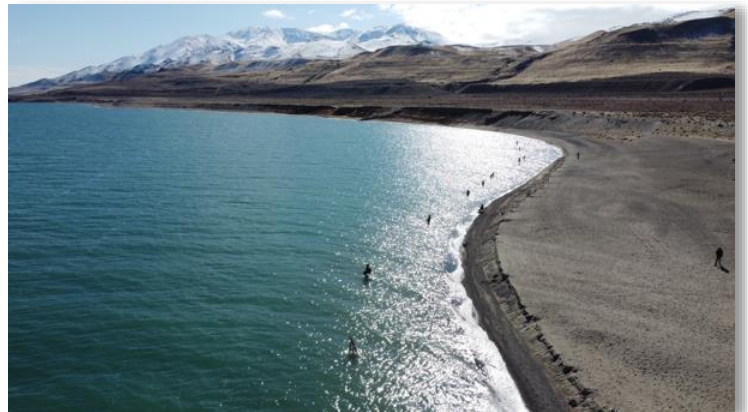
We are all lined up and ready to catch fish!