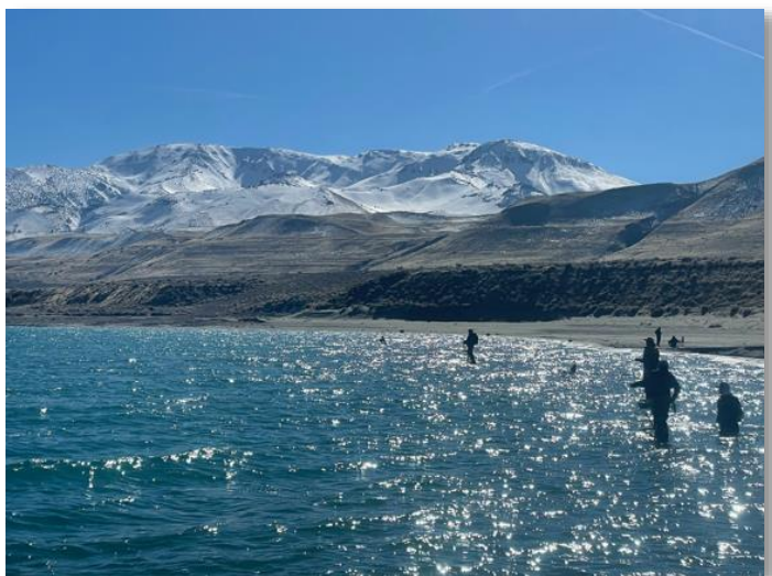
Pyramid Lake is a beautiful scenic lake