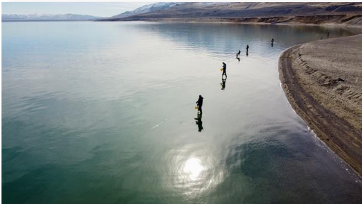
Awesome drone pic Shawn DeArmond- Sandhole Beach