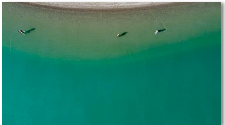
More awesome drone photos!