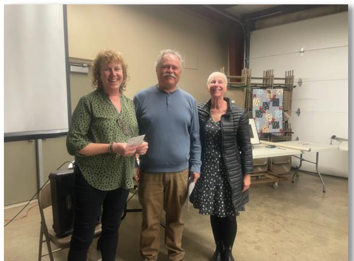
FFD Donation to Casting For Recovery