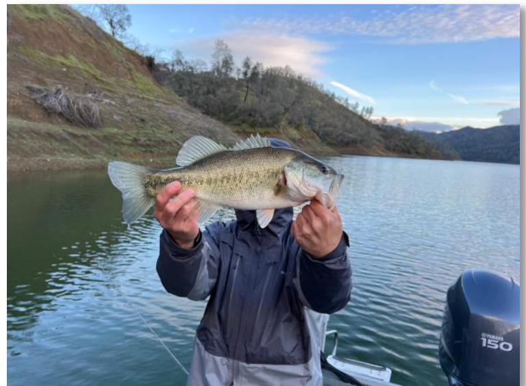
Is that Son Chong??