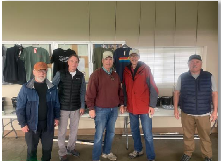
Thank you to all the volunteer that helped setup the Annual Dinner