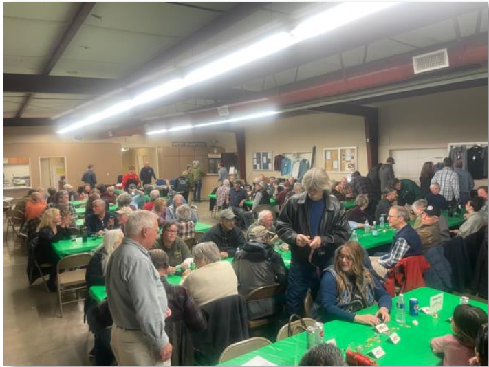
Great turnout for the 2023 FFD Annual Dinner