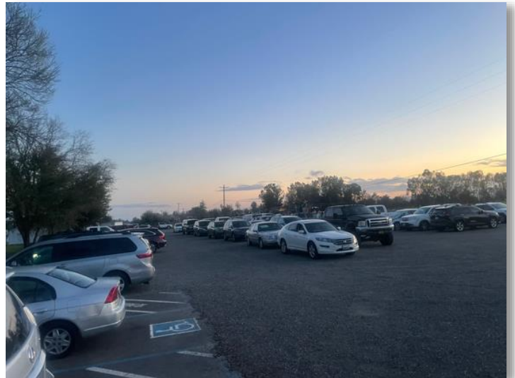
The parking lot is FULL!