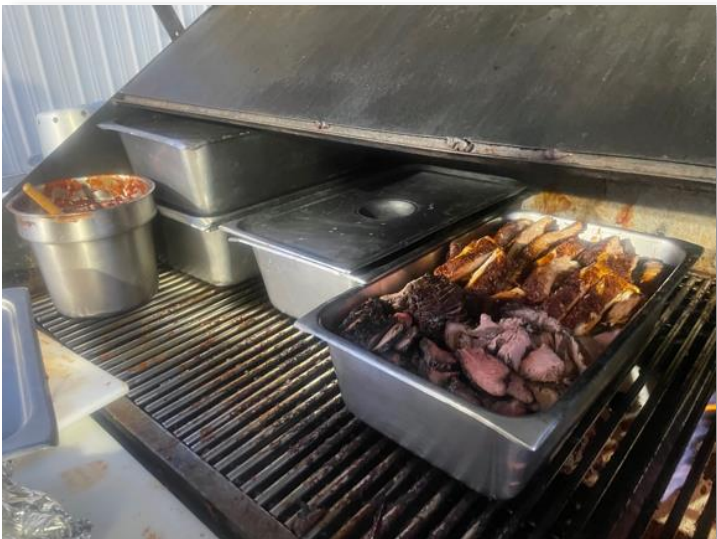
Hickory Hank is busy cooking dinner