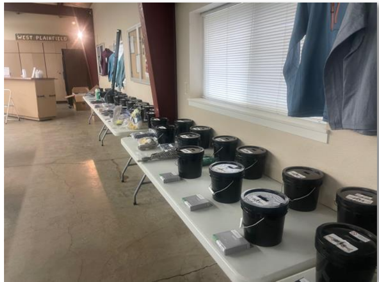
Look at all of those bucket items!