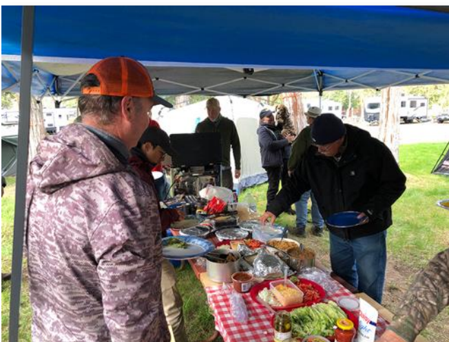
Dinner looks great!