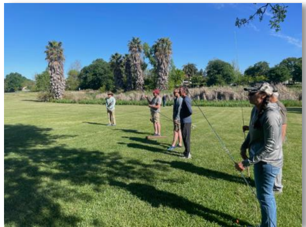
The group is listening intently