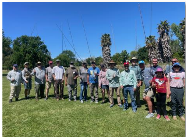
The FFD Casting Clinic group