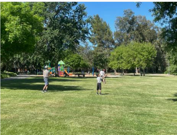
It was a beautiful day to learn how to fly cast