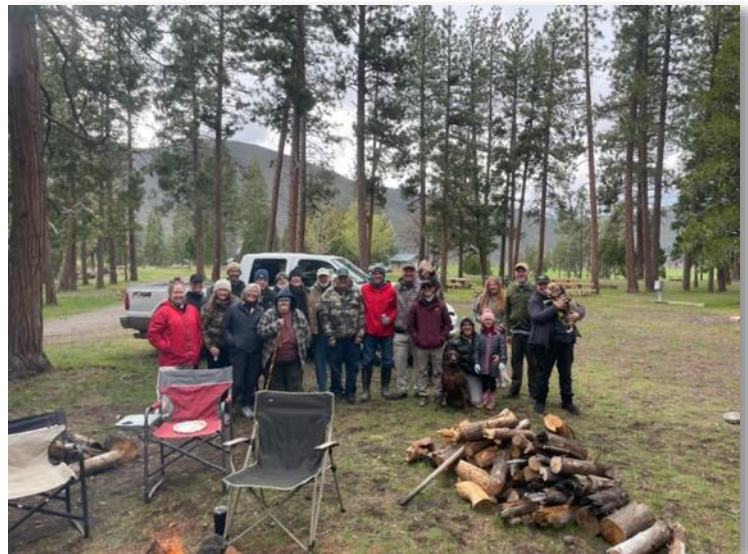
The FFD 2023 Hat Creek 101 Group