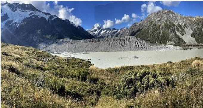
Mt Cook, Tasman, and Mueller Glaciers