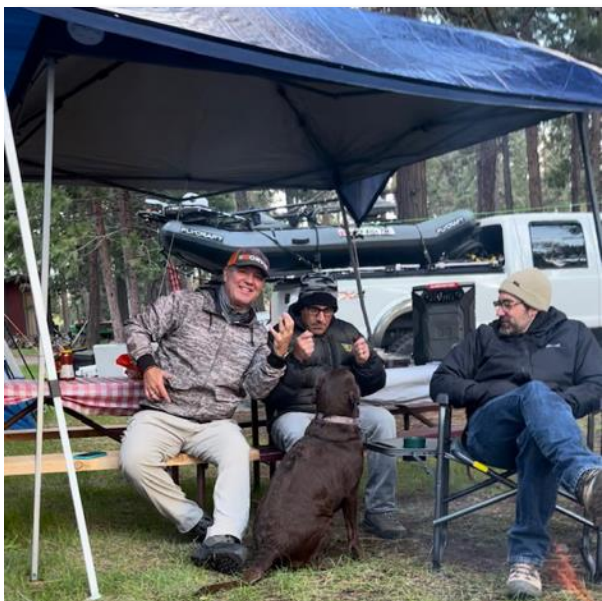
Time for some air guitar