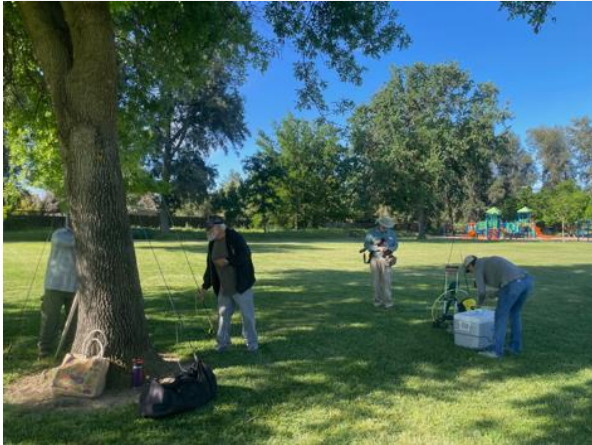
Time for everyone to get rigged up