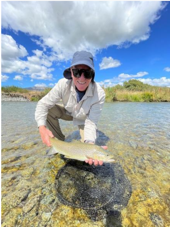
And more Browns!