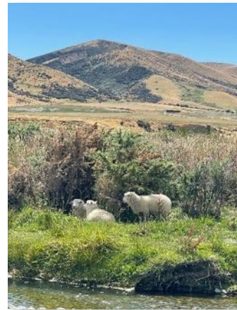
New Zealand wildlife