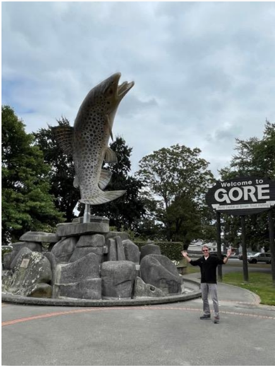
Kiwis love their Brown Trout!