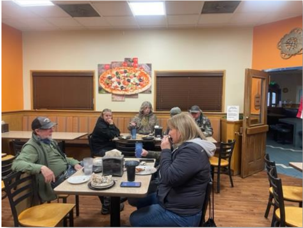
Pizza Night at Gepetto's Pizza

Twenty FFD Members met at Hat Creek Hereford Ranch Campground for the annual 101 FFD Hat Creek Weekend. The weather was a bit rainy, but everyone caught fish, some for the first time on a fly. Everyone seemed to have a great weekend.