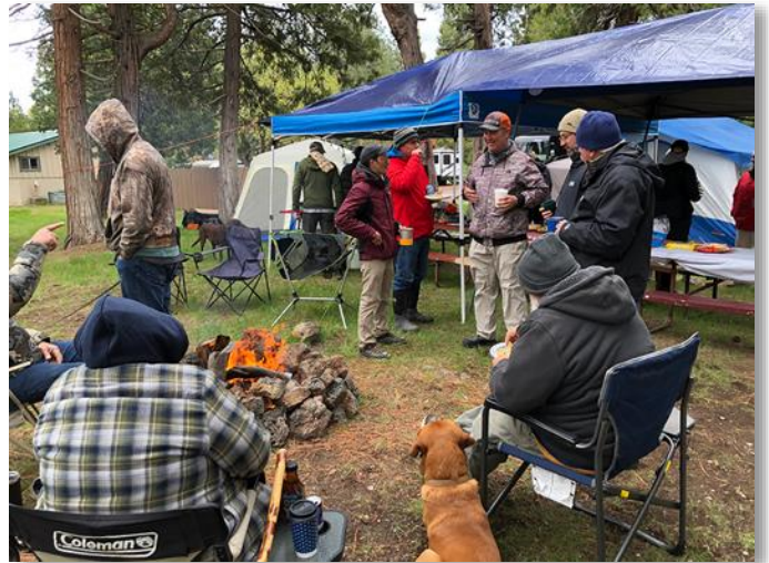
Time to tell some fish stories