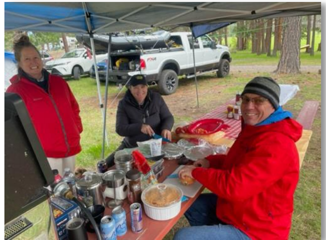
Time to start preppin the sides dishes