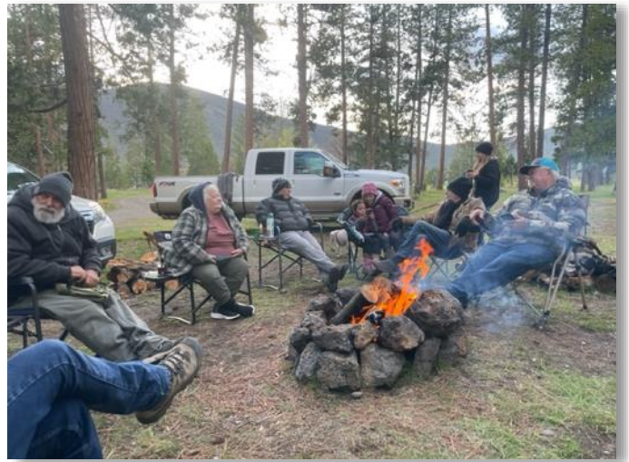
More fish stories!