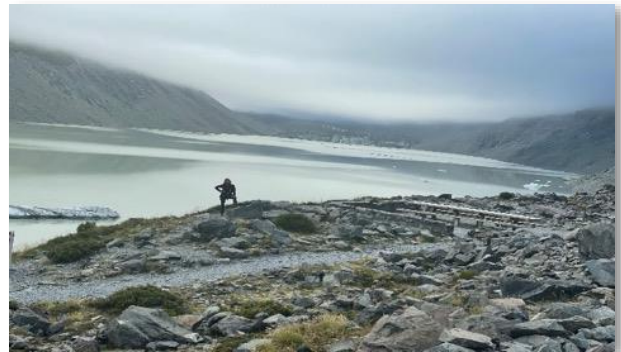
No trout, but somehow still interesting