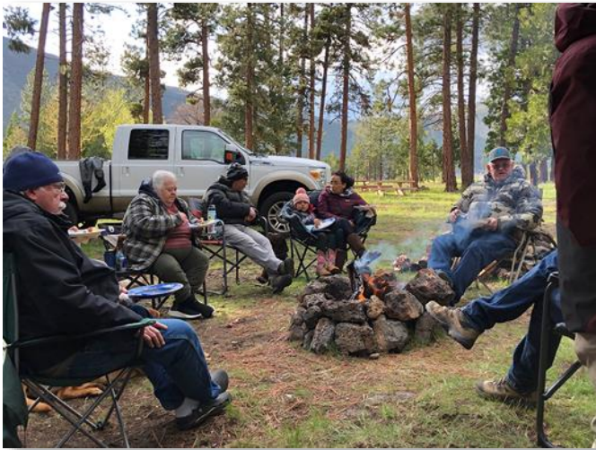
Nice and warm by the campfire