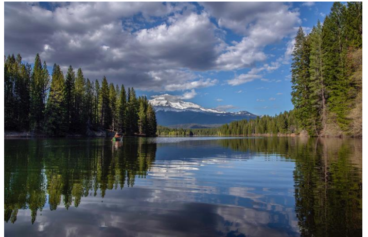
Still Waters Run Deep