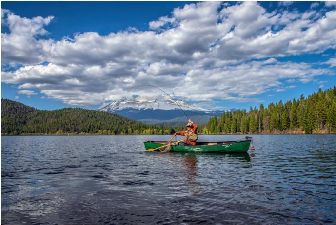
Scott Hooks Up!

We caught quite a few fish stripping woolly buggers on sinktip lines, all ranging from 17 to 22 inches, and all very strong fighters. If you are looking for some nice action while waiting for the rivers to come down, Lake Siskiyou not only has some nice fish, but the views of Mt Shasta are amazing. I'll definitely be heading back up in the next week or two.