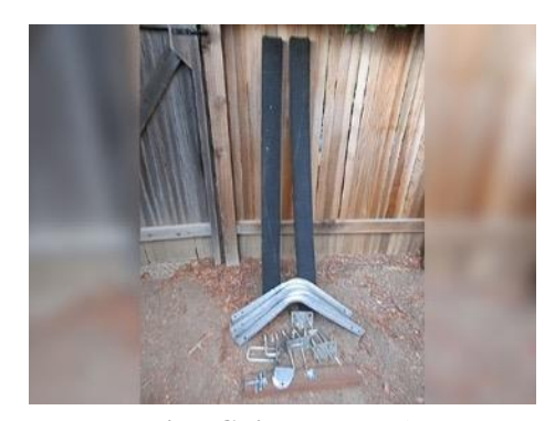
Trailer Guides – Darryl D.