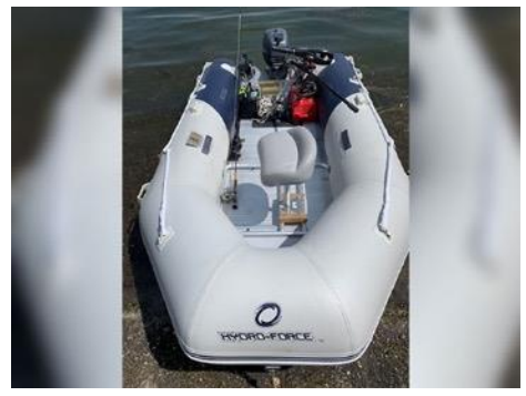
Inflatable – Contact Bob B.