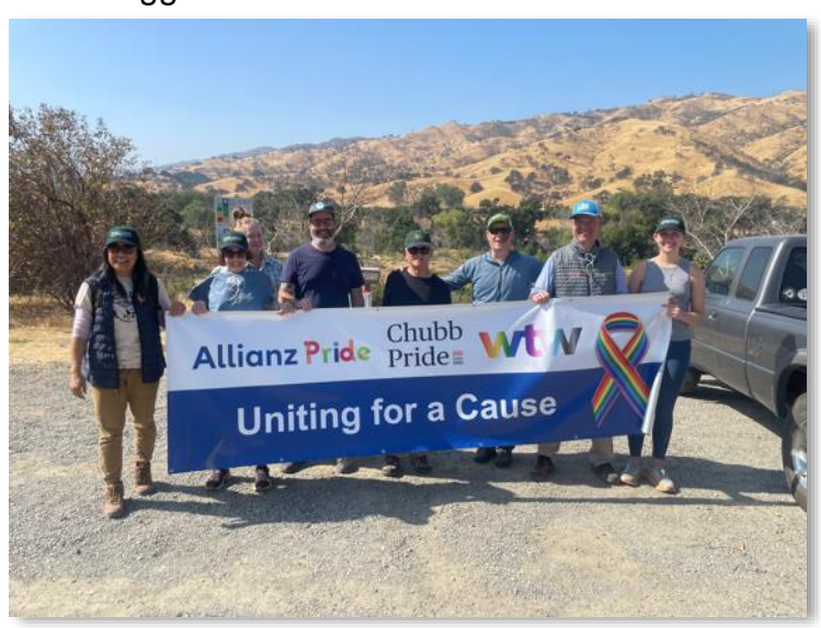
Great group of helpers that attended the Clean Up!