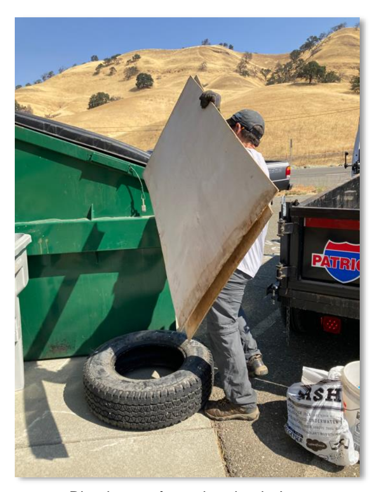
Big pieces of wood and a tire!