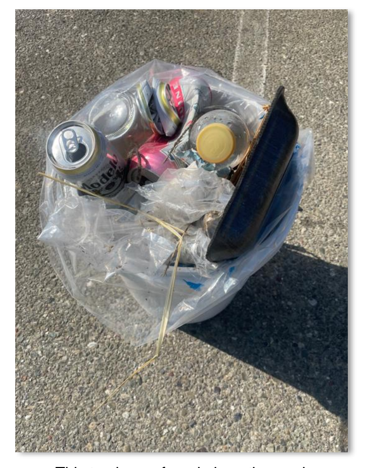
This trash was found along the road