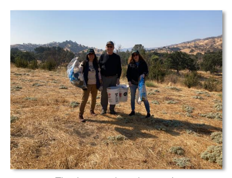
Thank you to the volunteers!