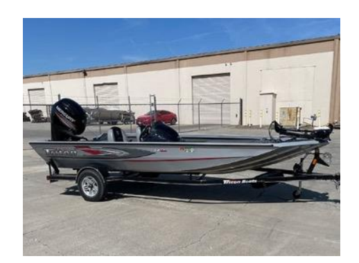
Bass Boat - Contact Rick W

Here's the "up-to-date" status of our Classifieds section: