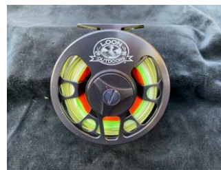
Loon Outdoor Reel Contact Bob Z.

Full details and prices of each item are on the website. Check it out!