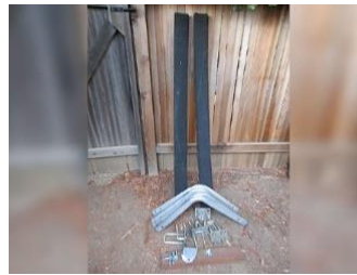
Trailer Guides Contact Darryl D.