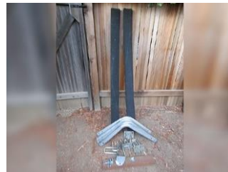
Trailer Guides Contact Darryl D.