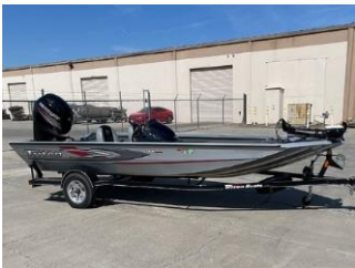
Bass Boat Contact Rick W.

Here's the status of all items on our Classifieds section: