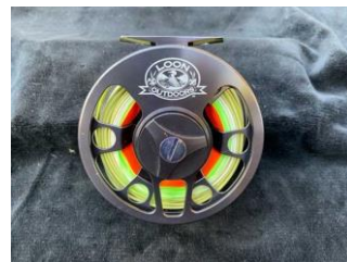
Loon Outdoor Reel Contact Bob Z.