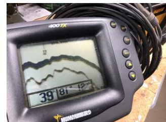
Humminbird Fish Finder Contact Paul B.

Full details and prices of each item are on the website. Check it out!