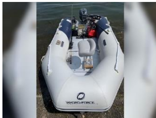
Inflatable Contact Bob Z.