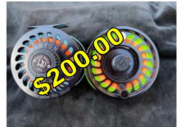
2 Ross Canyon Reels Contact Bob Z.