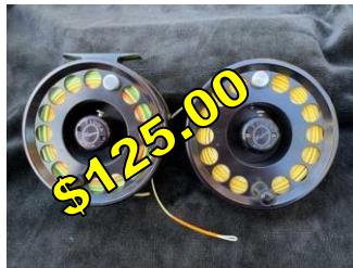
2 Tioga Teton Reels Contact Bob Z.