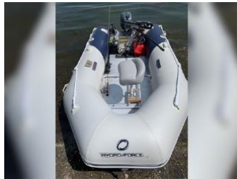
Inflatable Contact Bob B.