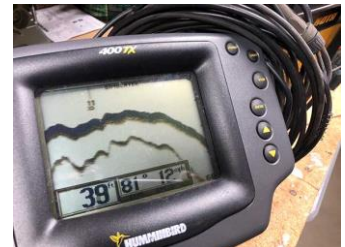
Humminbird Fish Finder Contact Paul B.

Full details are on the website. Check it out!