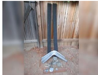
Trailer Guides Contact Darryl D.