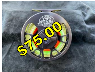
Loon Outdoor Reel Contact Bob Z.