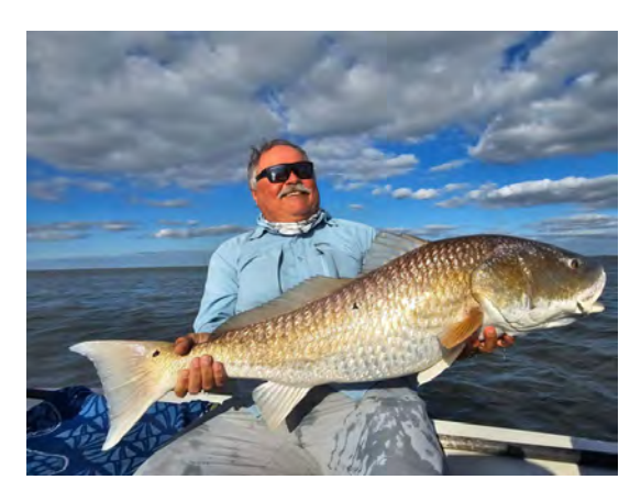
Seriously! Hurry up and take the photo.