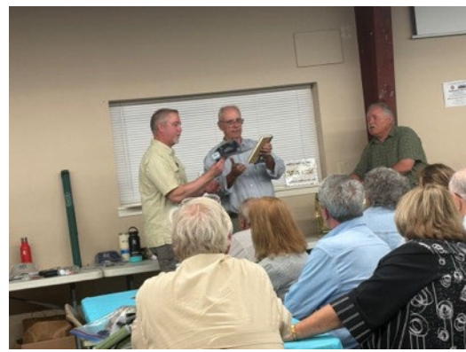
Raffle masters calling out the winners