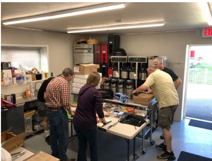
Pre-prep in da kitchen