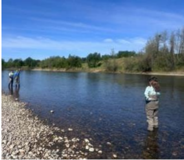
Practicing the Roll Cast

The recent March casting clinic held at Gristmill on the American River was attended by 4 extremely eager students on an absolutely beautiful day. With the assistance of Bob Zasoski, the session started with the versatile Roll cast performed on the dominate and non-dominate side enabling the student to perform this cast regardless of wind direction or obstacles next to them. Then, how to present the fly, so the fly line is directly upstream of that fly in the same current seam was taught using the Curve cast .