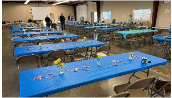
Tables ready for a wonderful evening