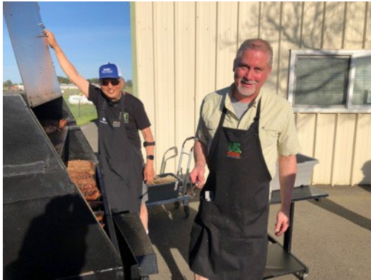
Hot job, well done