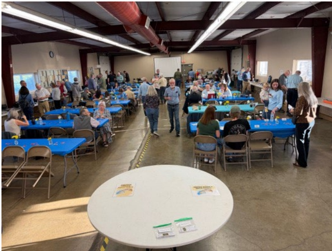
Off to a great start!