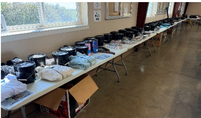
Buckets and more buckets...