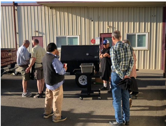
The chef's supervisors