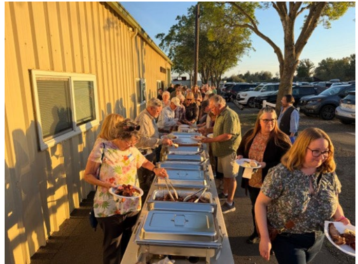
The finished product, enjoyed by all!