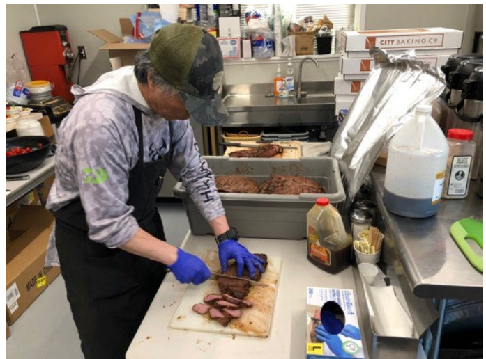
Son cutting up the amazing tri-tip!