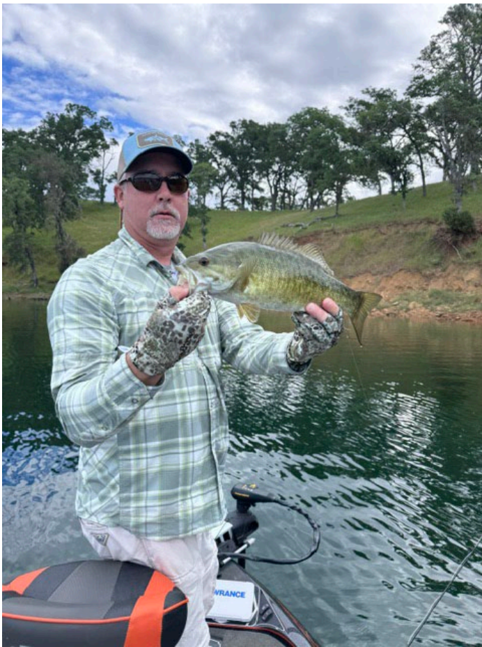
Nice smallmouth bass.