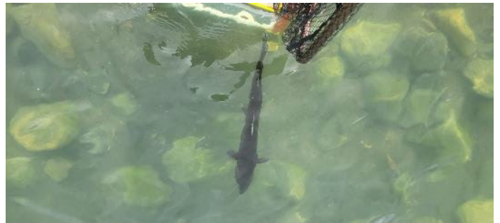
Swimming under the ladder