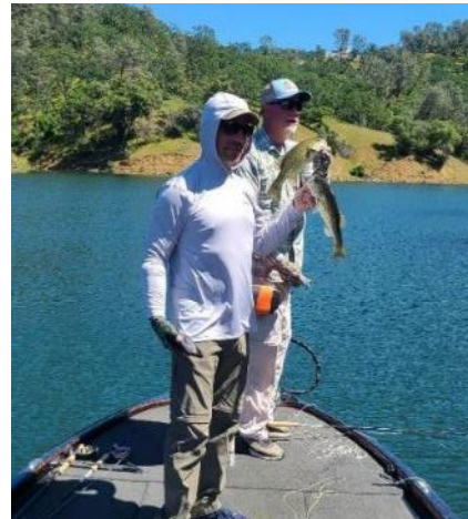
It's double time!