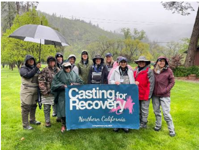
CFR participants in the rain