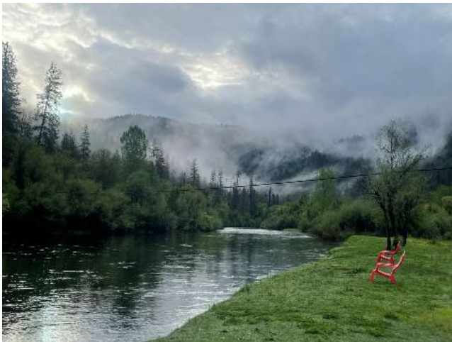
A small break in the weather at Indian Creek Lodge

The weather was cold with constant rain, ranging from drizzle to major downpours, but all the participants elected to brave the elements. We fished across from the hatchery below the Lewiston Dam, and a few fish were hooked but not landed ... but with a CFR retreat, that's not the point! The point is making new friends, giving back some of our skills, splashing hand-in-hand into the water for their first experience, practicing casting, and allowing the participants to focus elsewhere, beyond their health issues. For the river helpers, CFR staff and all the participants, it's a heart-warming experience.