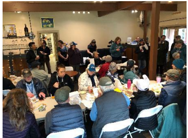
Lunchtime celebration and awards