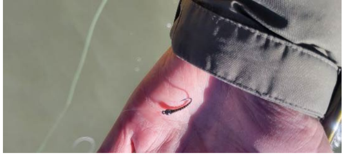
Ryan's secret midge pattern