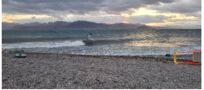
Peter after the storm hit – surfing but about to get dunked!