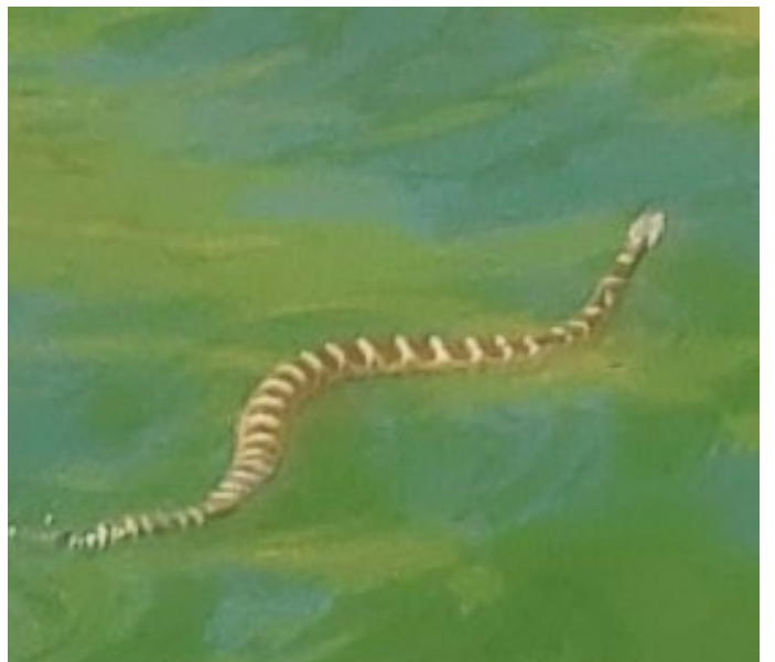
An unwelcome guest slithers for the shoreline!