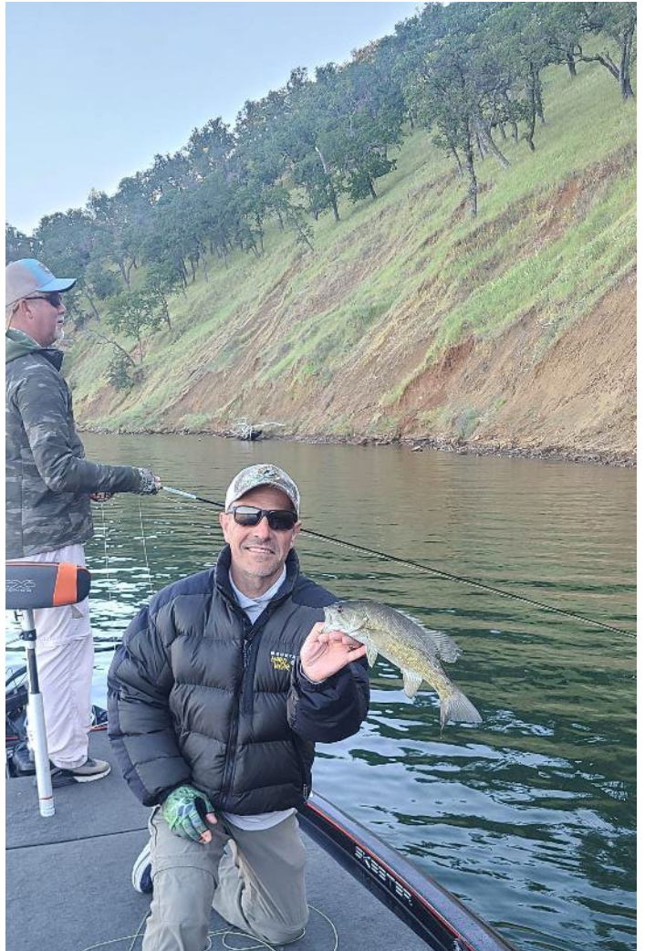
And another smallmouth bass