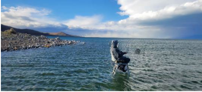
Peter before the storm hit - relaxing.