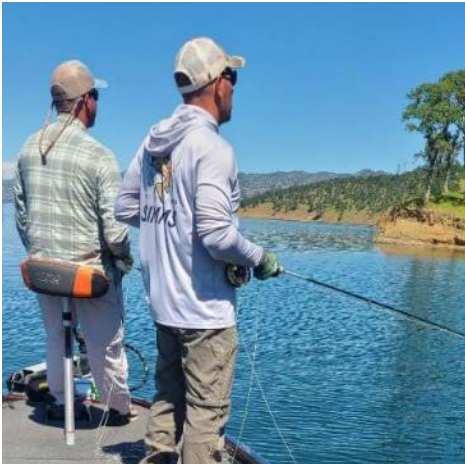
Easy fishing in calm waters today

A big thank you goes out to all the boaters that took out a non-boater for the day, and spent the time putting them on fish!