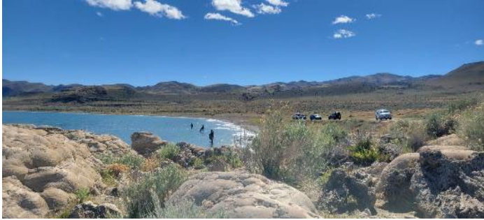
Club at Separator Breach