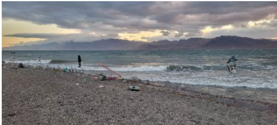
Peter testing the surface